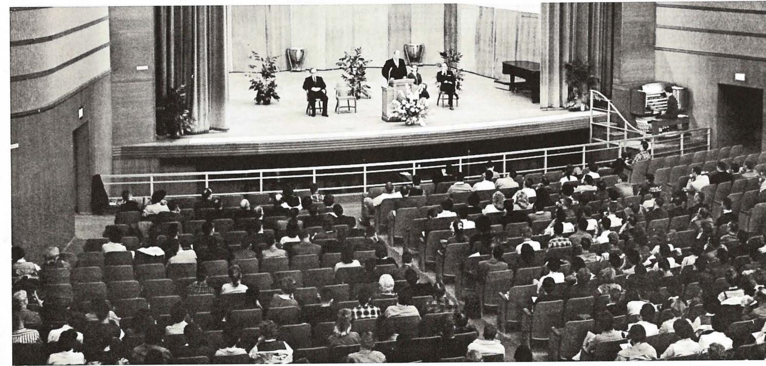
Above: Ed Landreth Auditorium, where competition will be held