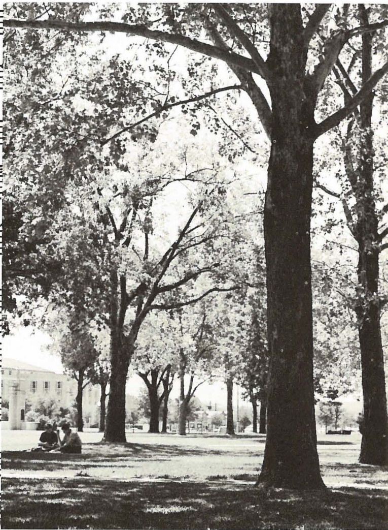
Texas Christian University campus lawn

The National Guild of Piano Teachers is highly pleased to have the opportunity of contributing the Grand Prize of $10,000.00 for the top-winner in the Van Cliburn International Quadrennial Piano Competition to encourage worldwide interest in artistic piano-playing and further to foster more friendly relations among the nations.