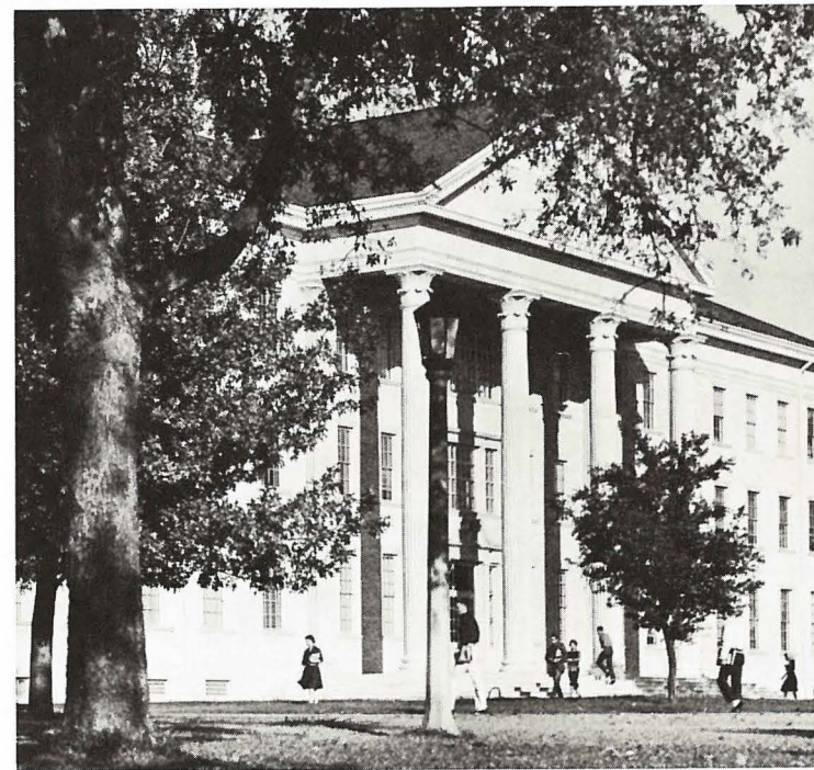
Above: Sadler Hall, Administration Building, Texas Christian University