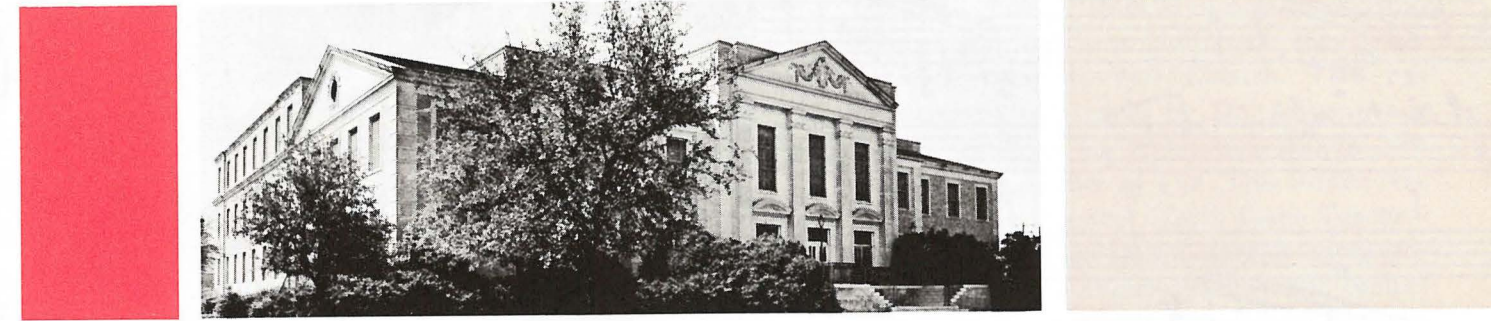
Below: Ed Landreth Fine Arts Building, Texas Christian University