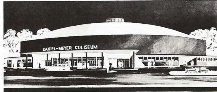
Below: Daniel-Meyer Coliseum, Texas Christian University