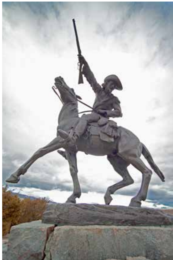
GERTRUDE VANDERBILT WHITNEY. Buffalo Bill, the Scout , 1923. Bronze, H. 149 inches. Buffalo Bill Historical Center, Cody, Wyoming, U.S.A., gift of the artist, 3.58.

Bill Historical Center in Cody, Wyoming. The 12.5-foot-high bronze follows the tradition of Frederic Remington and may have been inspired by his life-sized Cowboy of 1908 in Fairmont Park, Philadelphia.