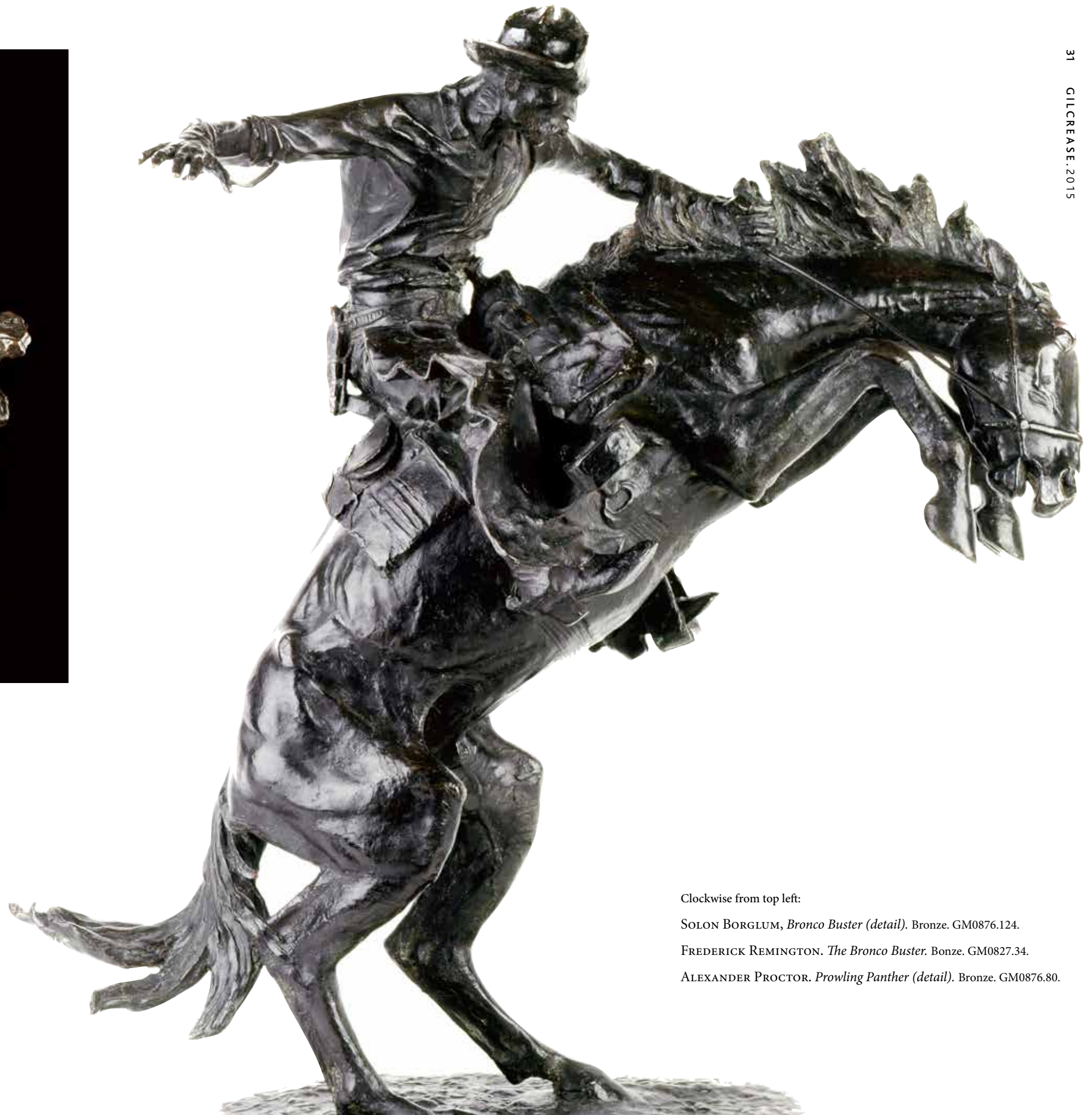
Clockwise from top left: SOLON BORGLUM, Bronco Buster (detail) . Bronze. GM0876.124. FREDERICK REMINGTON. The Bronco Buster . Bronze. GM0827.34. ALEXANDER PROCTOR. Prowling Panther (detail) . Bronze. GM0876.80.