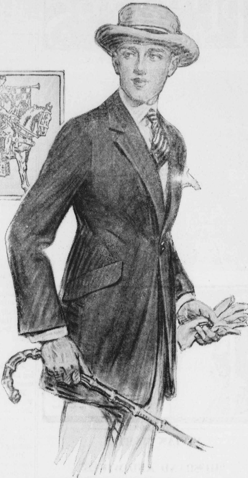
Copyright 1920 Hart Schaffner & Marx