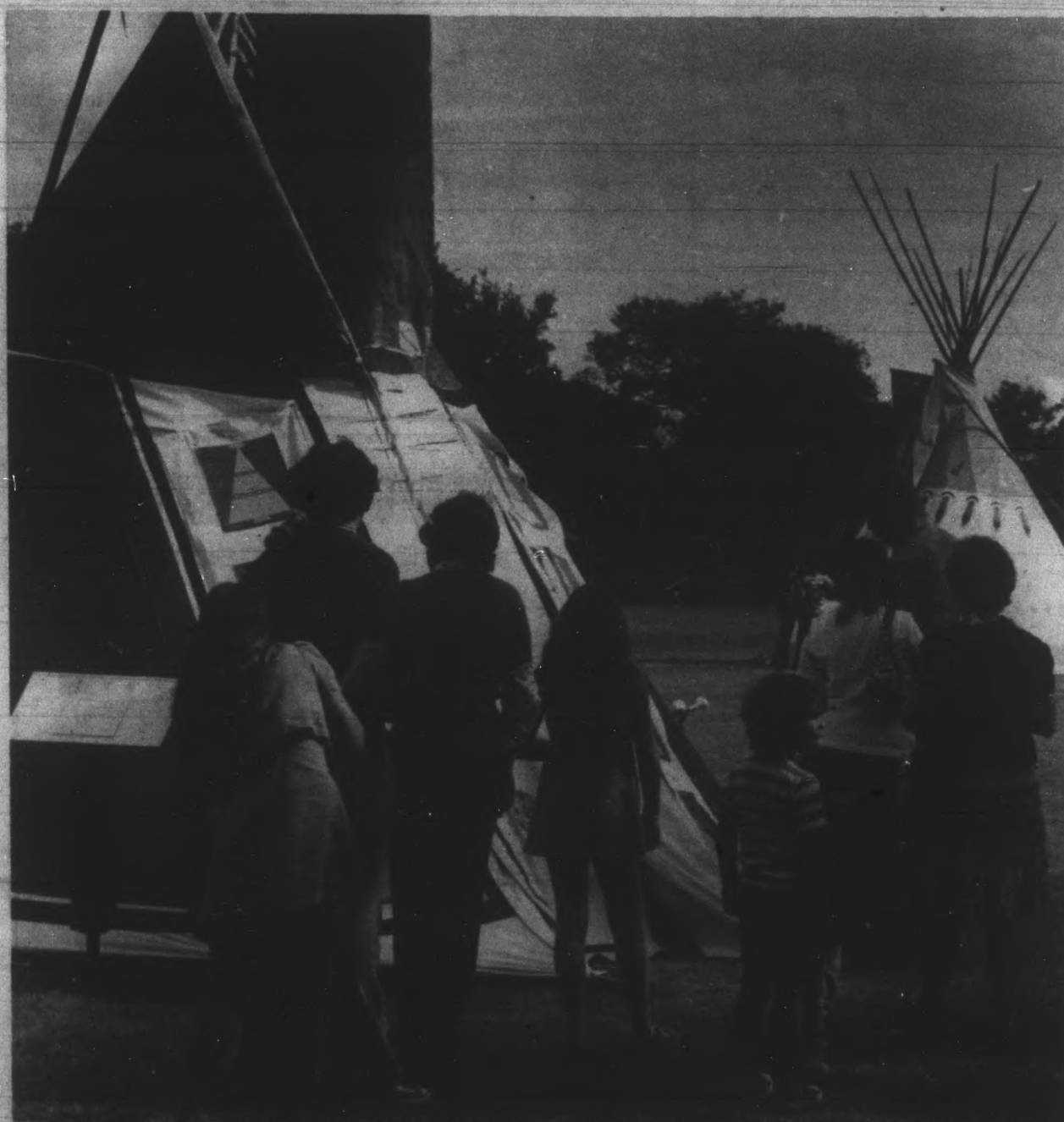
No, the Indians don't have Fort Worth under siege. Amon Carter Museum of Western Art is currently exhibiting replicas of painted American Indian teepees on the lawn of the Kimbell Museum.

Volume 73, Number 26 Texas Christian University . . . Fort Worth, Texas 76129 Thursday, October 17, 1974