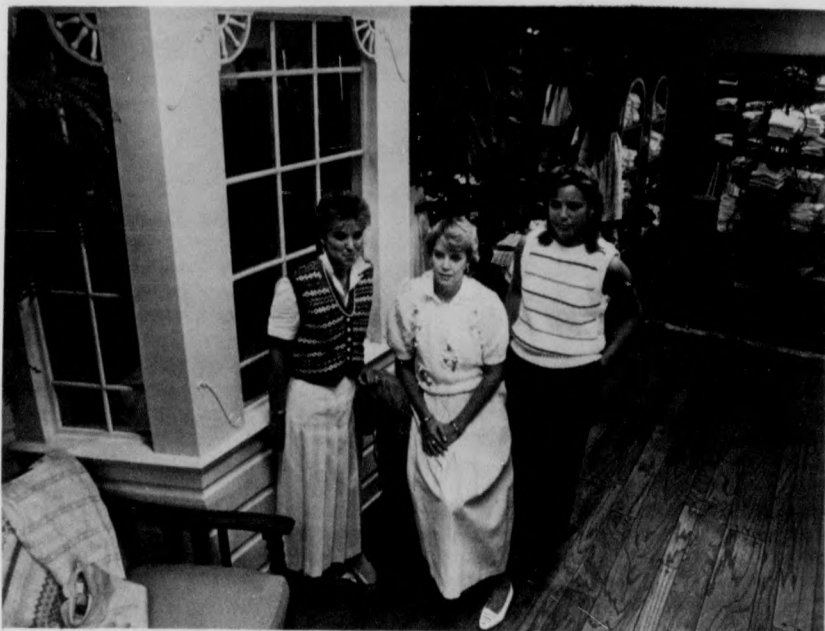
Models from Victoria's wear comfortable cotton sweaters in vibrant as well as muted colors. The sweaters are topped over long, pleated linen skirts and a

pair of poplin pants. Their hems are accented by low-heeled pastel loafers.