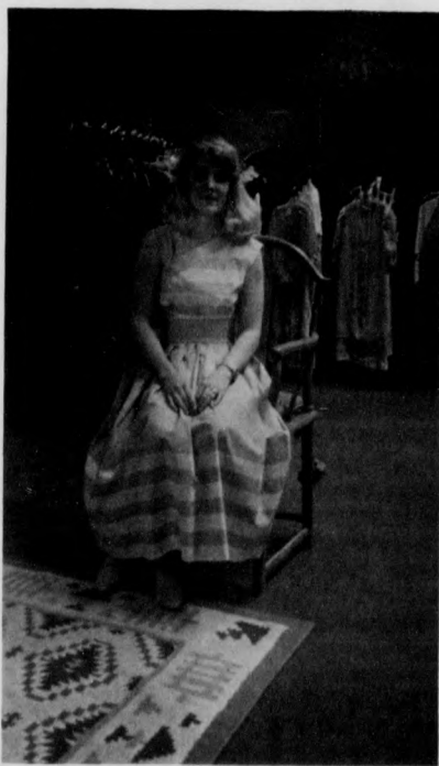
A model from Contempo Casuals wears a pastel striped sundress. Pastel colors such as turquoise, peach and grey are very popular this season.