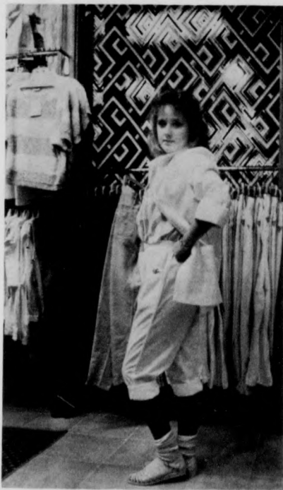
Loosely constructed jackets and cropped pants compose one of the basic styles for spring. Accessories such as plastic sandals complete the look.

“Peach, turquoise and grey highlight this season's pastel coordinates collection. These colors can be found in a variety of styles.”