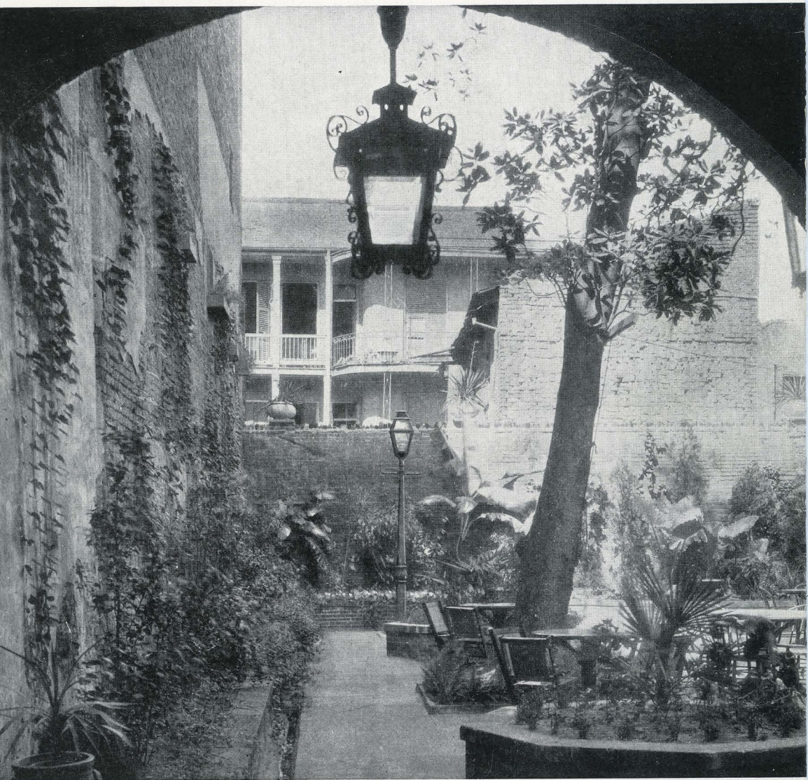
A courtyard garden in the French Quarter of New Orleans, eastern terminus of our Sunset Route.