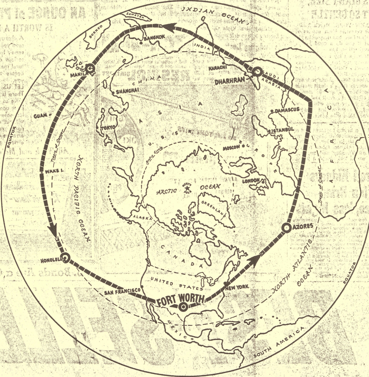
WHERE SHE FLEW—This is the route taken by the Lucky Lady II in her historic non-stop flight ended here Wednesday morning. The four aerial refueling points are shown—first the Azores, then Dharhran in

"We could have done the job with a B-36, but it requires no refueling in the air. The success of this flight means that we can now deliver an atom bomb to any place in the world that requires one. The air-to-air refueling technique is something the United States will keep to itself. Our only limit insofar as a large flight is concerned lies in the number of tankers and bombers we have in a given area. We still need our worldwide bases until we have