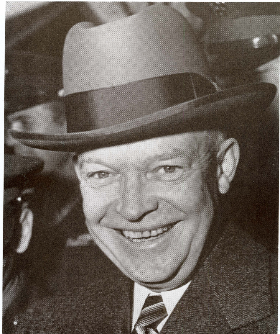
GENERAL DWIGHT D. EISENHOWER