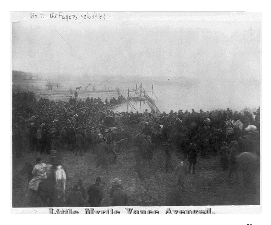
Figure 1. "Little Myrtle Vance Avenged #7" Photograph Paris, Texas 1893<sup>75</sup>

The photograph below with the caption "Little Myrtle Vance Avenged" was taken at the public lynching of Henry Smith in Paris, Texas in 1893.<sup>74</sup> Described as "The most horrible, atrocious and revolting lynching of modern times" by out-of-state reporters, crowds of people gathered to watch the execution unfold while smoke steamed from the scaffold. As this picture demonstrates, these events were publically attended by community members young and old. It also shows that executions dubbed as legal lynchings were taken outside of the main areas of town, to places were large groups could view the event.