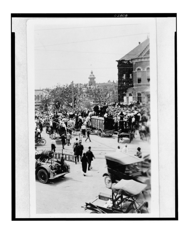
Figure 2. "Crowd gathering in street to watch the lynching of Jesse Washington, Waco, Texas," May 15<sup>th</sup> 1916<sup>84</sup>

limited to Waco. These events transpired across Texas counties, publically and in full view of the court and law enforcement officials, and were not suppressed by the state through any meaningful measures.