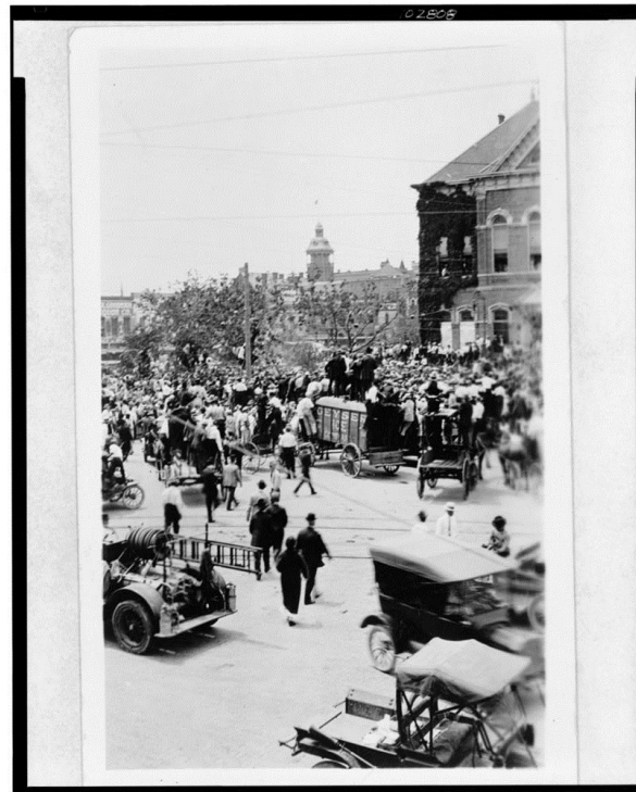
Figure 2. “Crowd gathering in street to watch the lynching of Jesse Washington, Waco, Texas,” May 15 th 1916 84

limited to Waco. These events transpired across Texas counties, publically and in full view of the court and law enforcement officials, and were not suppressed by the state through any meaningful measures.