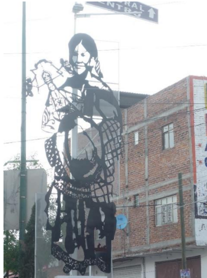
Indigenous woman and our Lady , Gobierno del Estado de Jalisco, San Juan de los Lagos

Another remarkable example of a feminine visual expression of faith is the silhouette of an Indigenous woman carrying in her hands the Virgin of San Juan. The silhouette is located on a main street in town. It is a piece of art of approximately 26 feet high.