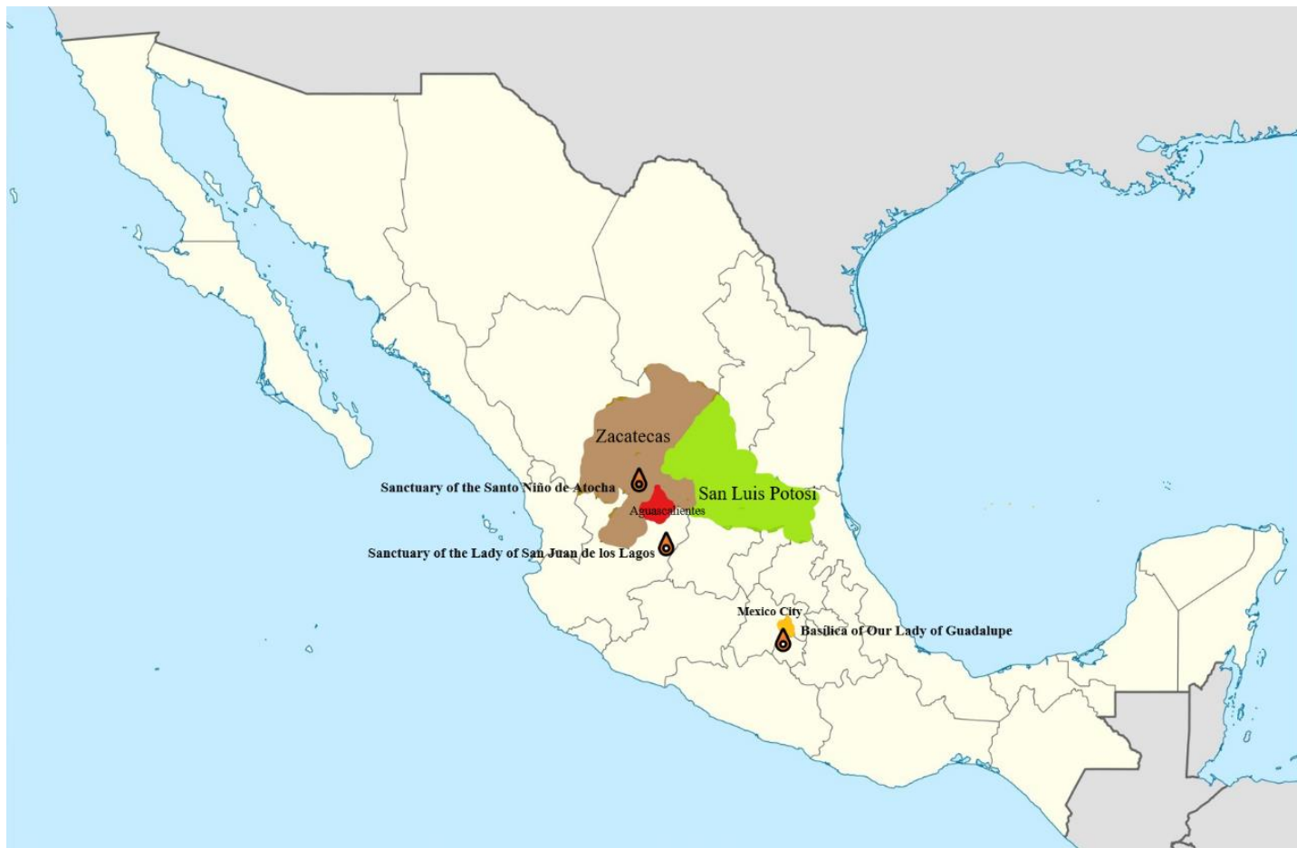
Map of Mexico: geographical location of Aguascalientes, San Luis Potosi, and Zacatecas. It shows the three most important religious sites in the country: The Basilica of Our Lady of Guadalupe, the Sanctuary of the Virgin of San Juan de los Lagos, and the Sanctuary of the Santo Niño de Atocha.

Aguascalientes, San Luis Potosi, and Zacatecas are the most religious states in the country. In 2010, 92 percent of the total population was Roman Catholic. This number was higher than the national percentage of Roman Catholic believers, which was 83 percent. Although Protestants and Evangelicals are the second largest religious groups, believers affiliated with these Christian traditions do not represent more than 3 percent of the total population in these states. 63 These statistics attest to the fact that Protestants and Evangelicals are