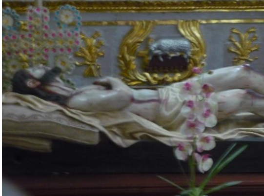
Jesús en su tumba, Sanctuary of the Virgin of San Juan de los Lagos

sacrifice. Believers could eat his flesh and drink his blood as a sign of the victory of good over evil.