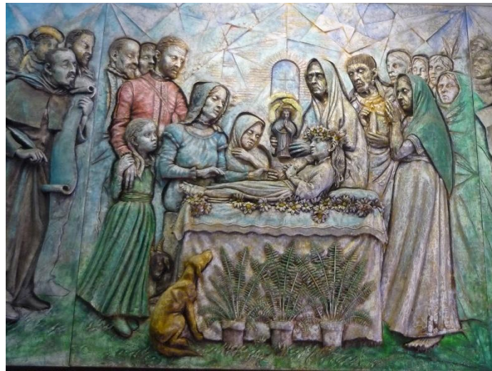
El primer milagro de la Virgen de San Juan en 1623, Sanctuary of the Virgin of San Juan de los Lagos