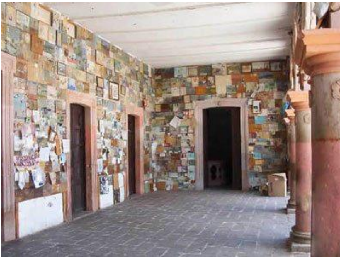
Walls of an adjacent patio outside church, Gallery of pictures of the Sanctuary of Plateros, Zacatecas. Accessed July 21, 2017. www.santuariodeplateros.com.mx