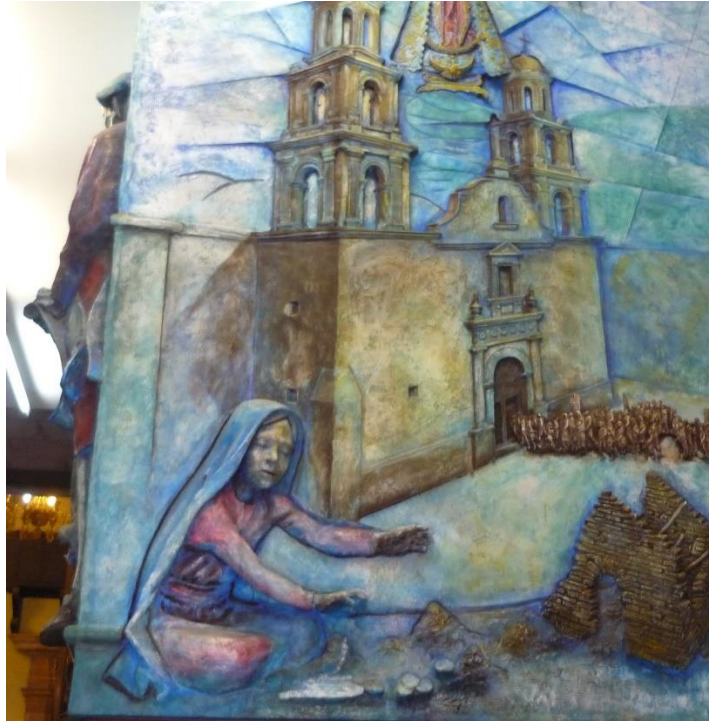
La Virgen en su segundo templo, 1653, Sanctuary of the Virgin of San Juan de los Lagos

stories, the resurrection of the girl and the spring that brought water to the people in town. In this way, these murals represent the foundation of the worship to the Lady of San Juan de los Lagos.