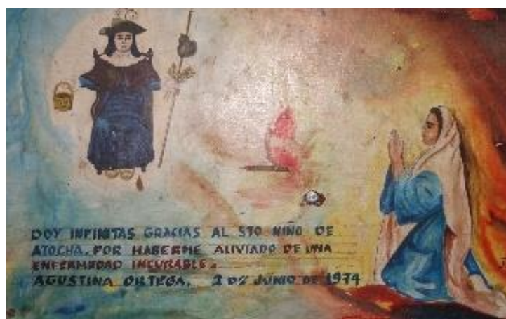
Altarpieces showing gratitude to the Santo Niño de Atocha for a miracle women have received, Gallery of pictures of the Sanctuary of Plateros, Zacatecas. Accessed July 21, 2017. www.santuariodeplateros.com.mx