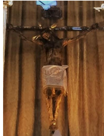
El Cristo de Plateros, Sanctuary of the Santo Niño de Atocha Gallery of pictures of the Sanctuary of Plateros, Zacatecas. Accessed July 21, 2017. www.santuariodeplateros.com.mx

The Virgin of Atocha is located on the right of the Christ of Plateros. As mentioned before, this image arrived the church as a donation in the mid-1800s. In the past, Jesus-boy was on the Virgin's arms, but when people identified Jesus-boy as the one performing great miracles, they placed him below the Christ of Plateros in a crystal box. St. Demetrious is located left to the Christ of Plateros. St. Demetrious is a saint of the church. In 1566, people dedicated the foundation of the city of Plateros to him. Back then, the city's name was Real de Minas de San Demetrio.