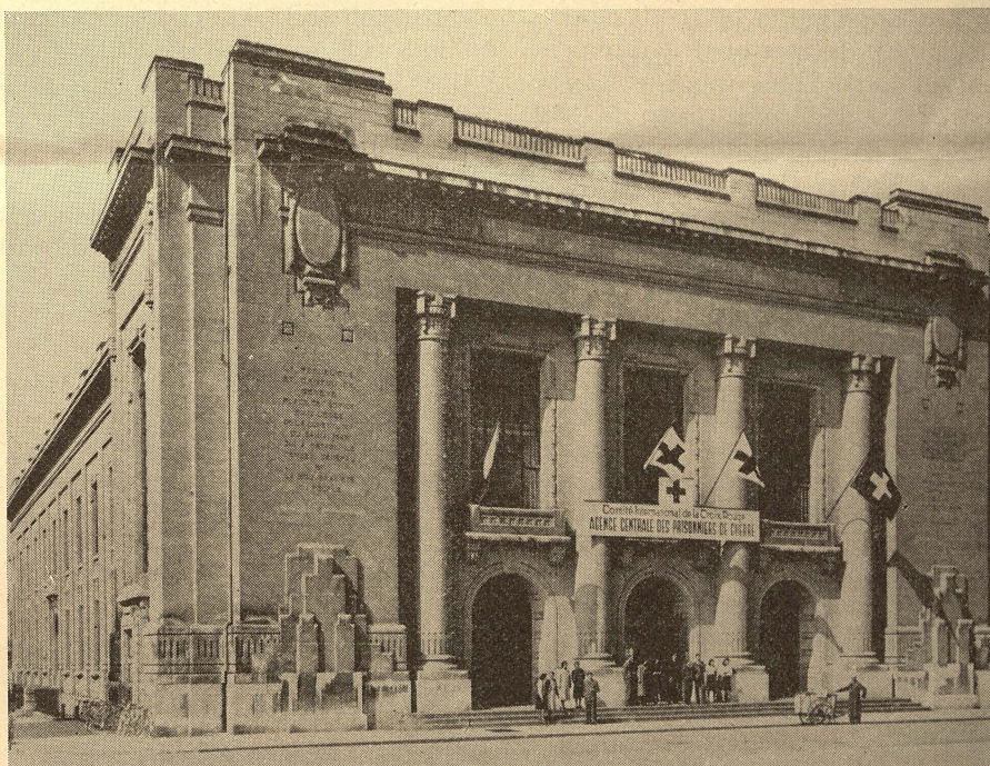
Central Agency for Prisoners of War, International Red Cross, Geneva

The carrying out of the provisions for sending in parcels and relief to camps, and for exchanging information between prisoners of nations at war and their own countries, is now a tremendous task requiring a large force. In Switzerland there are between 5,000 and 6,000 people employed by the I. R. C. C., chiefly on that job—the majority of them working as volunteers. Its mail averages over 60,000 pieces daily; its card index of 12,000,000 cards is said to be the largest in the world. If news seems to move slowly to you, please remember the enormous amount of detail work involved and the difficulties of transportation. Many people are trying constantly to improve this humanitarian service.