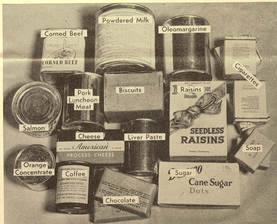
The contents of an American Red Cross standard food package

A list of the contents of this special package, which will be of the same size and weight as the standard food package, will be published later. They will be such, however, as to remind our prisoners of former Christmases spent under happier circumstances, and of the fact that, if we cannot have them with us in person this year, we shall be with them in spirit.