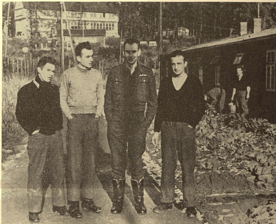
Group of American aviators await the war's end in Stalagluft III