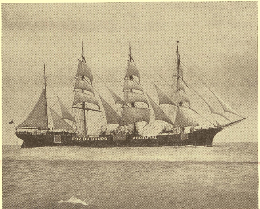
Carrying 329,788 Red Cross standard food packages for United Nations prisoners of war, the FOZ DO DOURO sailed from Philadelphia for Lisbon on April 28, 1943. She made the crossing in 21 days.

Each prisoner has at least one uniform in serviceable condition, and one good pair of shoes. The supplies of uniforms and miscellaneous articles of clothing coming from Red Cross shipments were reported to be ample. The prisoners of war, from among their own number, do the