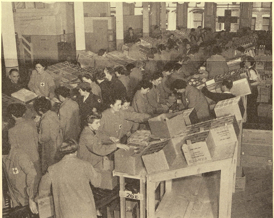
Conveyor line carries Red Cross food packages to gluing machine

The carton itself is a container about 10 inches square and 4½ inches