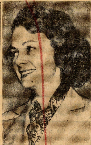
JUNE LOCKHART. ... She's Touring Texas.