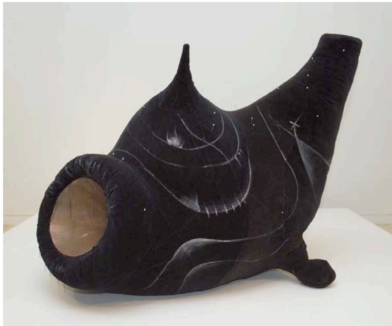
Figure 1 Dorothea Tanning Pincushion to Serve as Fetish , 1979 Dallas Museum of Art, Dallas Reproduced in Dallas Museum of Art Collection, Dallas, TX, http://collections.dallasmuseumofart.org/