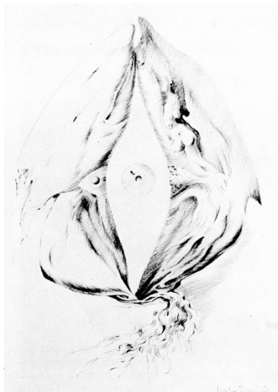
Figure 5 Dorothea Tanning Early Eye , 1948 Collection of the Artist Reproduced in Donald Kuspit, Dorothea Tanning: On Paper 1948-1986 (New York: Kent Fine Art, Inc., 1987), unpaginated.