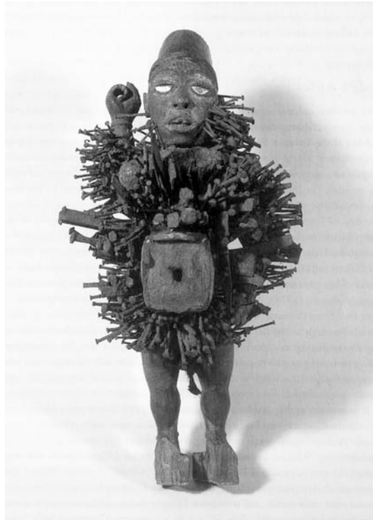
Figure 16 The Kongo peoples Nail “fetish” ( nkondi nkisi ), 19 th century Liverpool Museum, England Reproduced in Louise Tythacott, Surrealism and the Exotic (New York: Routledge, 2003), 115.