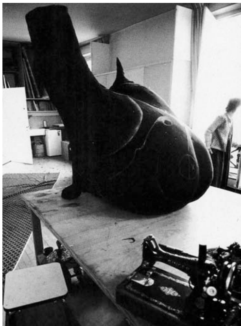
Figure 13 Dorothea Tanning photograph of Pincushion to Serve as Fetish in studio, Paris, 1979 Reproduced in Jean Christophe Bailly and Robert C. Morgan, Dorothea Tanning (New York: George Braziller, 1995), 334.