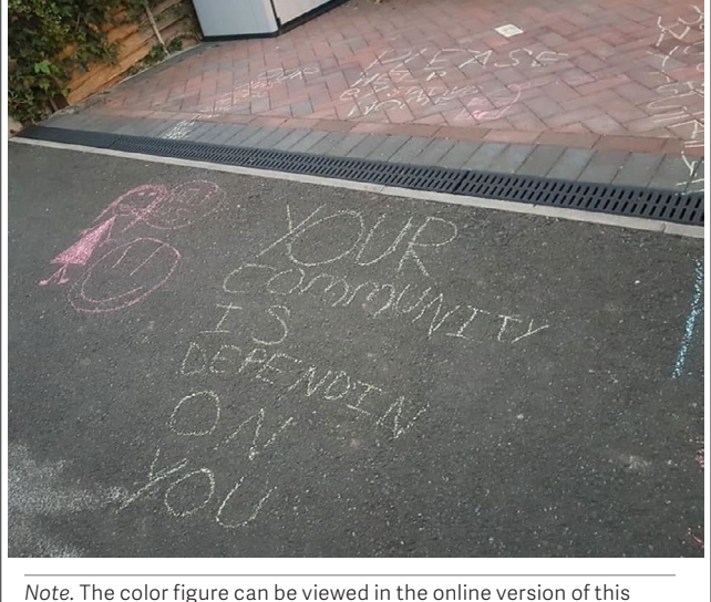
Figure 7 10-Year-Old Valerie's Message to Her Community

article at http://ila.onlinelibrary.wiley.com.