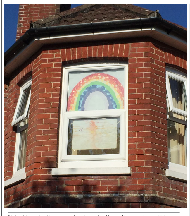
Note. The color figure can be viewed in the online version of this article at http://ila.onlinelibrary.wiley.com.

National Health Service Rainbow Poster in House Window