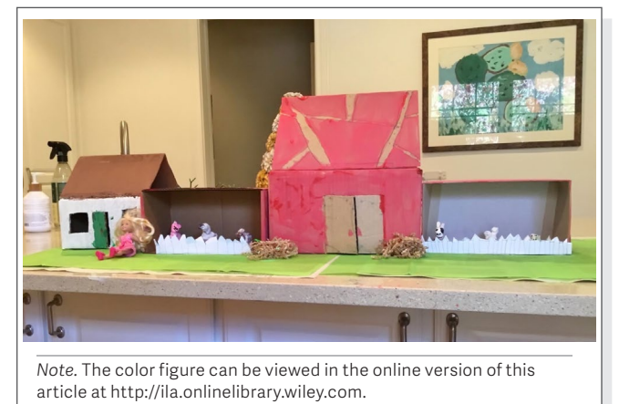
Figure 3 Characteristics of Charlotte