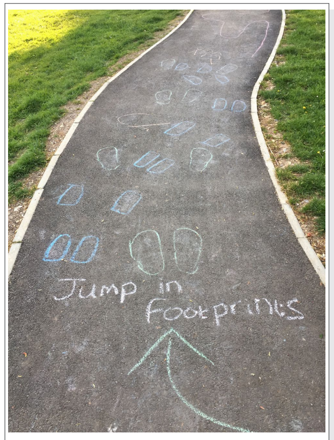
Note. The color figure can be viewed in the online version of this article at http://ila.onlinelibrary.wiley.com.