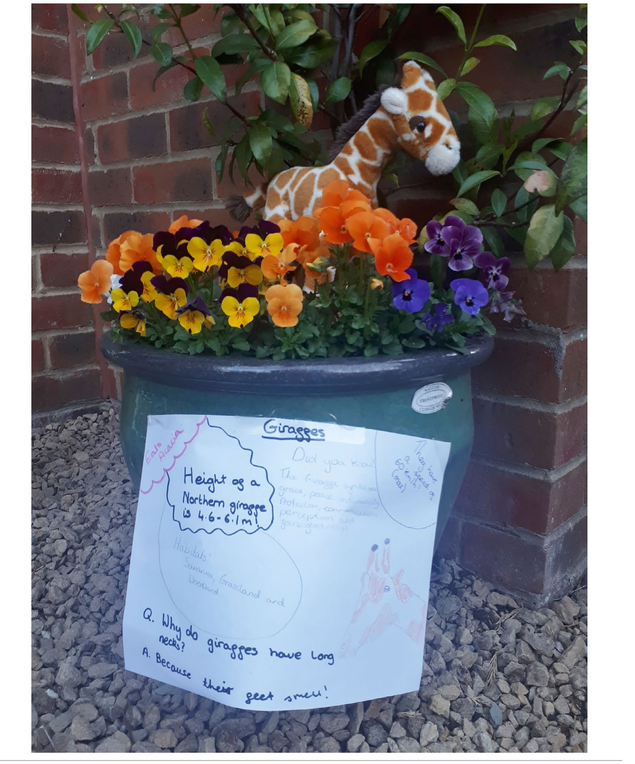
Figure 4 Giraffe Information Poster

Note. The color figure can be viewed in the online version of this article at http://ila.onlinelibrary.wiley.com.