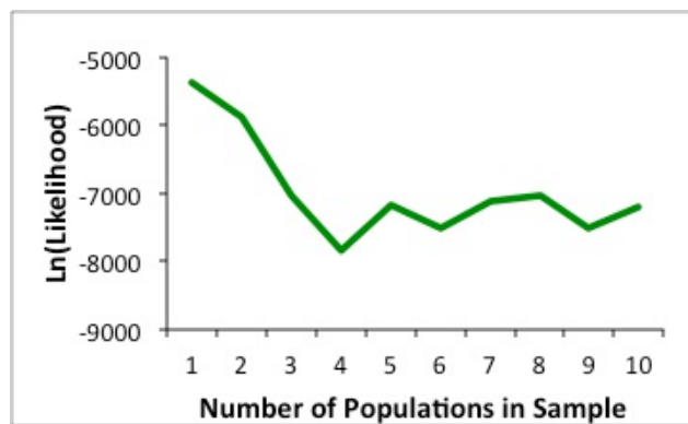
Figure 4. Log-likelihood of number of 1-10 populations as calculated by STRUCTURE.

There was no evidence for strong genetic structure or clear groupings of individuals among our samples using either the microsatellite loci or mitochondrial haplotypes. STRUCTURE indicated our samples likely represent a single population with the highest log-likelihood at K = 1 (one population) (Figure 4). AMOVA analysis indicated that 100% of the genetic variance occurred within categories and 0% of the variance occurred between categories (Table 5).