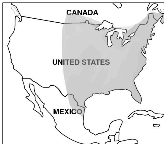
Figure 1. Range of eastern red bats. Modified after Cryan et al. 2003.

winter (Moorman et al. 1999). Males have been found to be more common than females in the northern extremes of their summer ranges (LaVal and LaVal 1979; Cryan 2003; Mormann and Robbins 2006). In the southern part of their range where the winters are less severe (like Texas), eastern red bats may stay in the same region year round (Schmidly 1991). The extent of these non-migrant (i.e., permanent resident) populations is currently unknown.