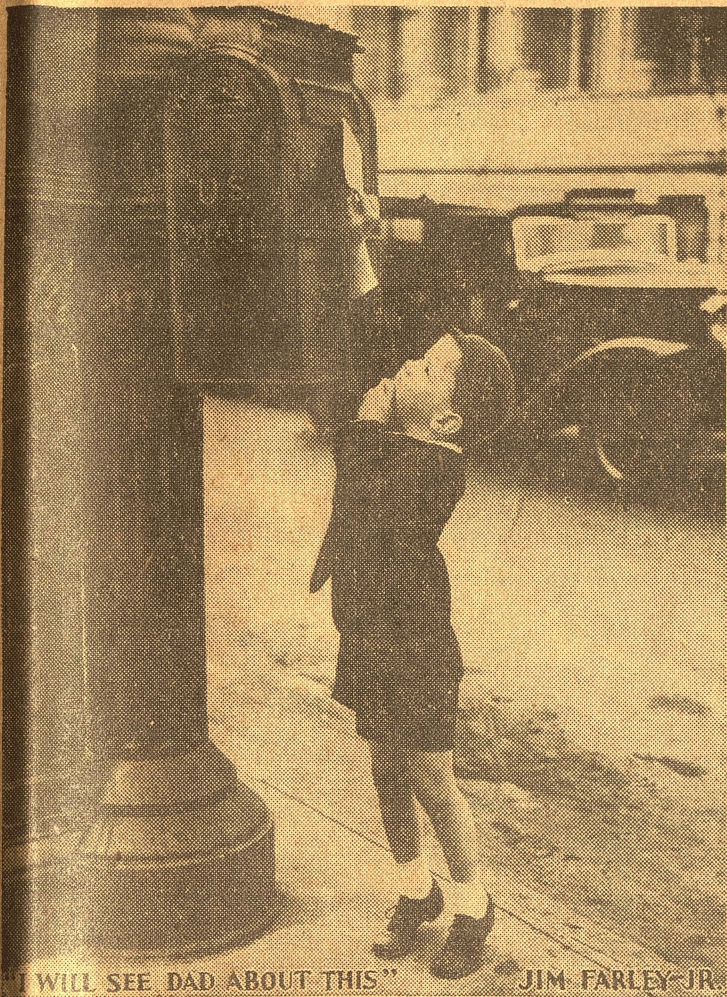
"I WILL SEE DAD ABOUT THIS"

JERUSALEM, June 28 (AP).—Australian airmen flying new American-made Tomahawk fighter planes Saturday shot down six American-made Glenn Martin bombers piloted by