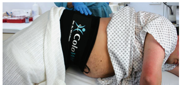
FIGURE 2. ColoWrap device in situ.

After application of either the study device or the sham, an opaque sheet was placed transversely over the participants and was kept in place for the duration of the procedure. All patients were then placed in the left lateral decubitus position and underwent anesthesiologist-administered sedation and colonoscopy per standard procedure. Propofol was used in the vast majority of cases, and conscious sedation with fentanyl and midazolam was used in two cases. Patients and study coordinators were unblinded to the intervention, but endoscopists, nurses, technicians, and anesthesiologists were blinded to treatment assignment. Manual pressure and patient position