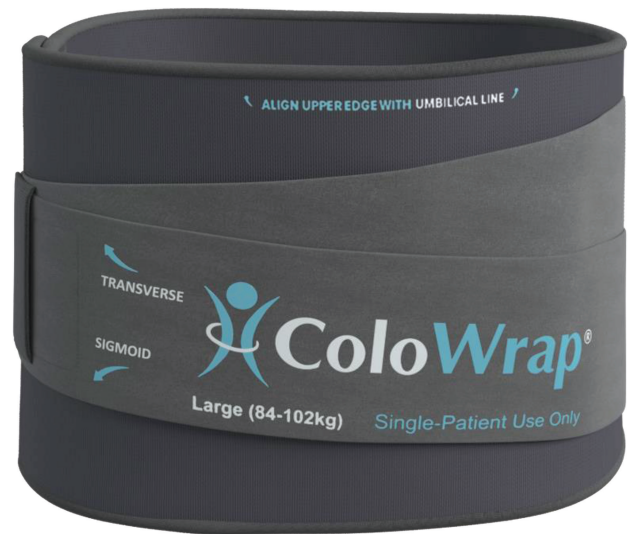
FIGURE 1. ColoWrap device (ColoWrap, LLC).

Designed specifically for splinting during colonoscopy, ColoWrap consists of a neoprene-composite primary wrap that provides adjustable, uniform compression to the lower abdomen and a secondary support strap that allows focused compression to be iteratively applied to the sigmoid and transverse colon (Figures 1 and 2). Although the manufacturer now offers the device in several sizes, the regular size (100 cm) ColoWrap was used on all participants in the study for uniformity. In addition, to maintain blinding, the secondary strap was engaged preemptively during application to target the sigmoid region. The staff were not