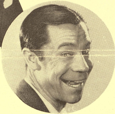
Joe E. Brown

THE NATION LAUGHED at Joe E. Brown in that uproarious baseball film, "Elmer the Great." It was Joe's turn to laugh this time, and he found plenty of amusement in the World Series. He was one of many celebrities who made the Book-Cadillac their headquarters while in Detroit.