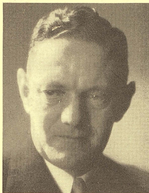
Octavus Roy Cohen