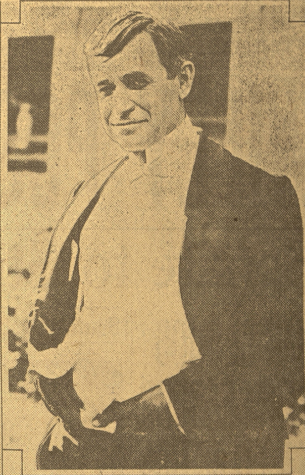
Will Rogers posed for this picture years ago when, as a youth, he was a student at Kemper Military Academy in Boonville, Mo., long before he became the nation's leading humorist.