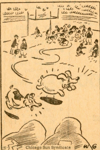
"You and your big mouth!"

Fo Ch Ki h Tec n Eas T Te Re p Ro 7 Am Te T Ro h Opt n No M Riv n Ap E Co- Th and been cran $80 on sti yo yo Mu off of est vat hov new Stu AF 207 You Modern of Cold Today, mother colds is the thr time. I VapoR Pen upper cial, Sti surfac Th speci Invi morr the c O spec actic and