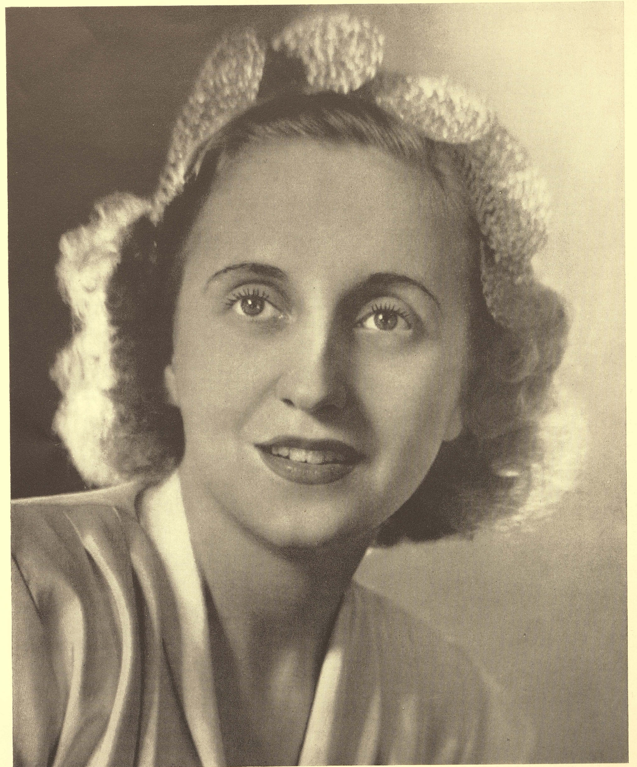
MISS MARGARET TRUMAN