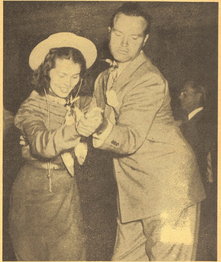
At The Westerner Ball, Bob Hope, a frequenter of premieres, trod a few measures of the Conga with dimpled Miss Galveston, who ought to be in pictures.