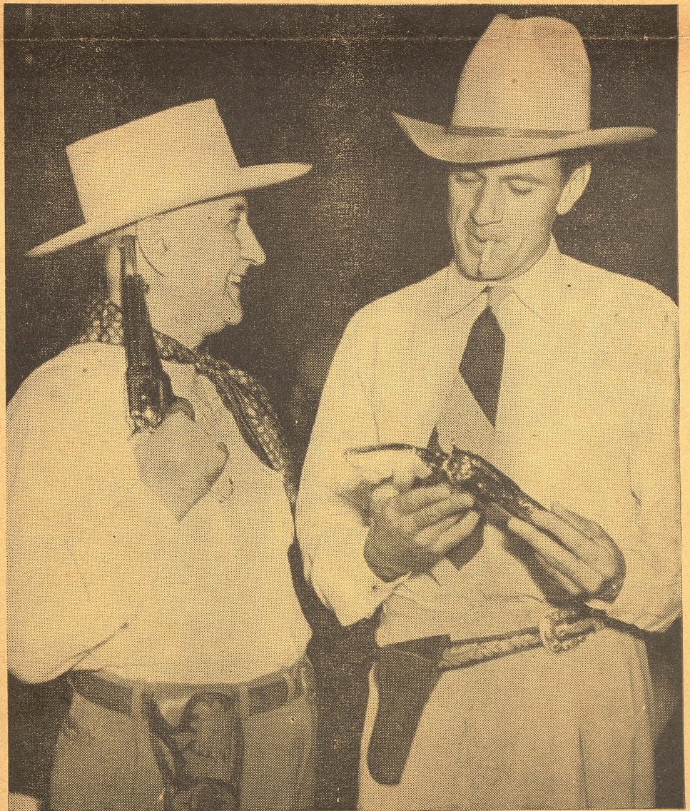
The gent scratching his ear with the pearl-handled sixshooter is Amon Carter, everybody's host. The other gun-toter is The Westerner himself, Gary Cooper.