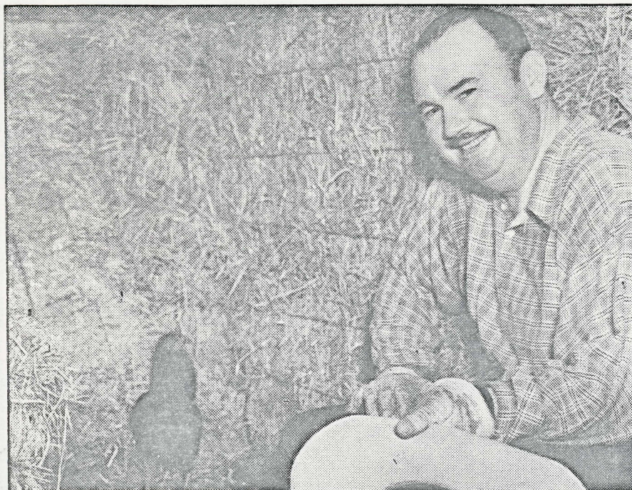
Close-up of the Jazz King doesn't leave much doubt as to his yen for farming. At left is a game hen and her chick. Fighting cocks and hens came from Texas on same train as Whiteman band returning from recent trip