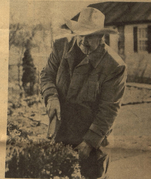
Trimming the hedge is good exercise.