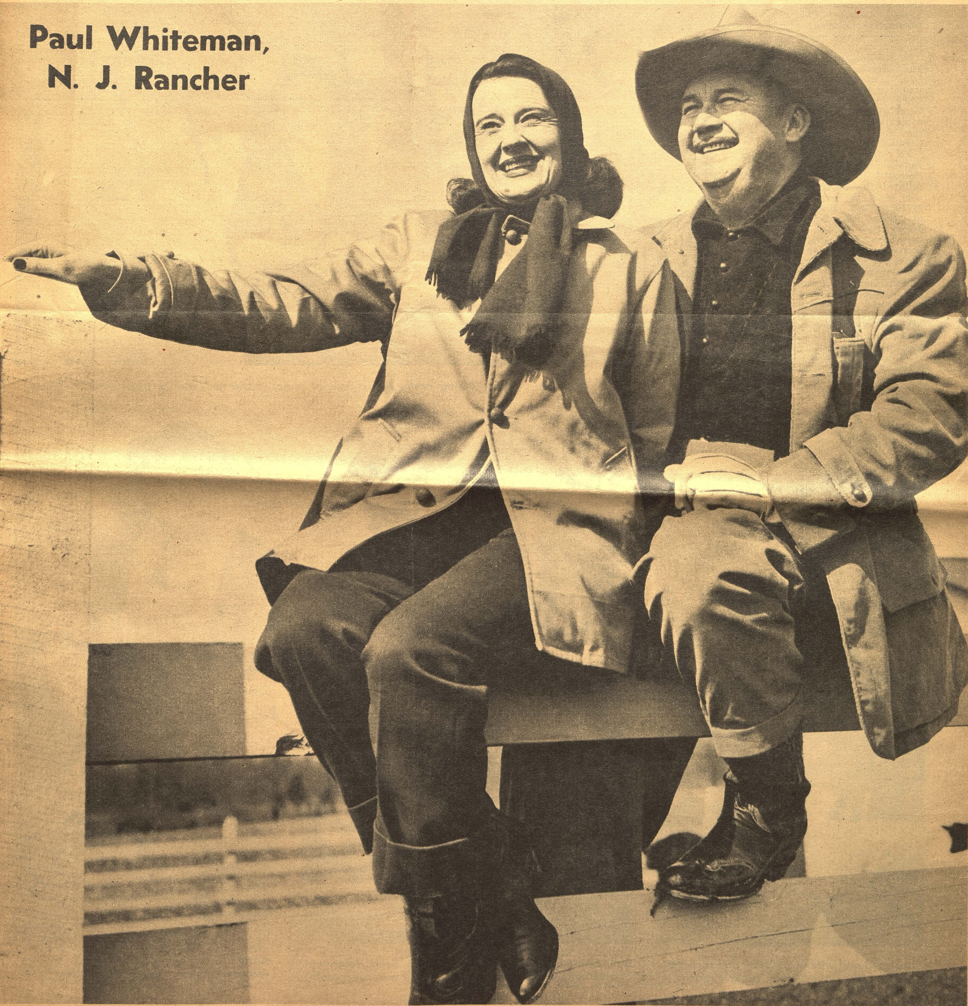
Paul Whiteman, N. J. Rancher

Musical Director and His Wife on Their Hunterdon Farm. (See Pages 6 and 7).