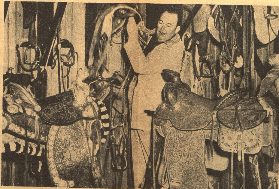
One Whiteman saddle (left foreground) has engraved silver worth $3,000.