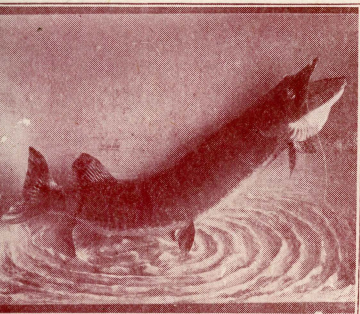
A Forty-two Pound Muskie