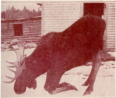
Bill the Moose—Bowling to the Bards