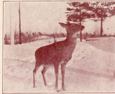
Minnie—Pet of the Bards