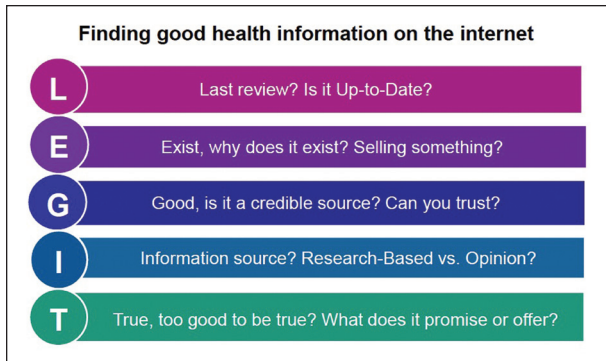
Figure 1. Finding good health information on the internet.

( https://kidshealth.org/en/teens/sexual-health/ and https://kidshealth.org/en/teens/bullies.html ). To provide contrast to these credible sites, we located non-credible website exemplars that addressed similar health topics.