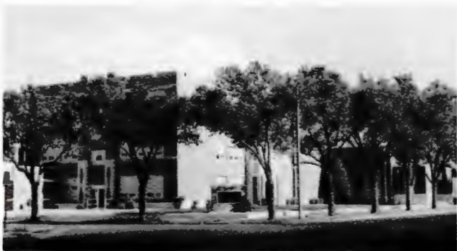
JR. HI & HIGH SCHOOL

The schools are accredited by Kansas Department of Education and North Central Association. The high school curriculum offers almost sixty units of credit per year and the elementary curriculum is geared to individualized instruction. The libraries are the finest in facility, equipment and materials. The senior high school library has been designated a DEMONSTRATION LIBRARY .