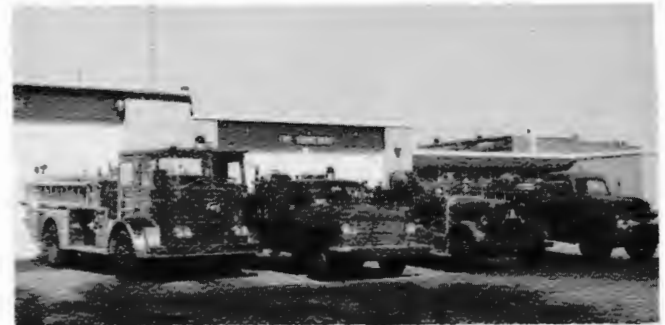
CITY OFFICE & FIRE DEPARTMENT

The modern City Building houses the municipal business office, police judge, utilities superintendent's office, and a meeting room for the commissioners. Equipment for an up to date city-county fire department is housed in the rear of the building.