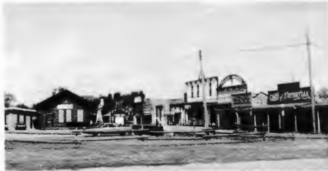
LOOKING WEST INTO BURKETOWN, U.S.A.

A true to life reproduction of western life near the turn of the century.