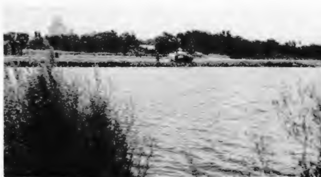
KIOWA COUNTY LAKE

In the Greensburg community, we have many forms of recreation for those interested—three picnic and recreation parks, swimming pool, lighted ball park, Kiowa County State Lake, tennis courts, bowling, golf, archery, and trap shooting.