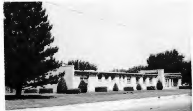
KIOWA COUNTY MEMORIAL HOSPITAL

The modern City Building houses the municipal business office, police judge, utilities superintendent's office, and a meeting room for the commissioners. Equipment for an up to date city-county fire department is housed in the rear of the building.