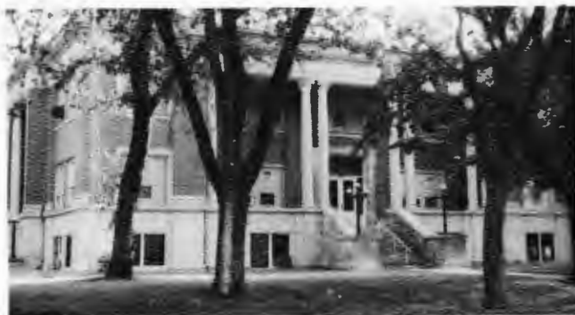
KIOWA COUNTY COURT HOUSE

Activities play an important part in school life and Greensburg participates in all major sports, speech/debate activities, music, plus many school sponsored activities in the fine arts. The RANGERS are a member of the Iroquois League, one of the finest in the state and the RANGERS were winners of the annual sweepstakes trophy in 1970-71.