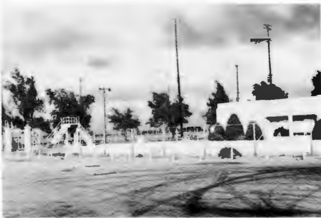
MUNICIPAL SWIMMING POOL