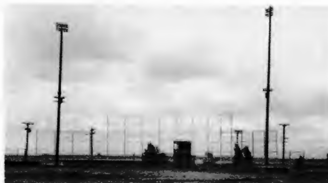
MODERN LIGHTED BASEBALL FIELD