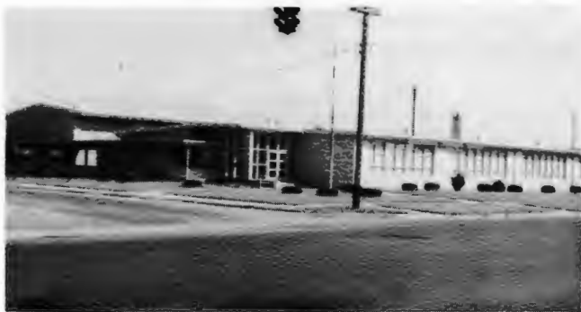
PRIMARY AND ELEMENTARY

Greensburg Schools are organized as a 6-2-4 system with a principal at each level and the system is housed in two major buildings. The district employs approximately sixty persons and enrolls 500 to 600 students.