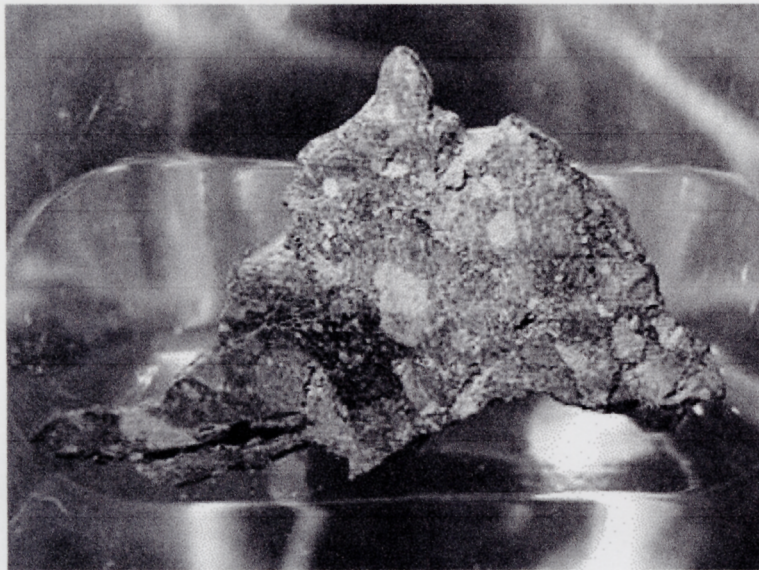
Photo of a 1.54-gram subsample

This is a photomicrograph of a small fragment (the ticks on the left are a millimeter apart).