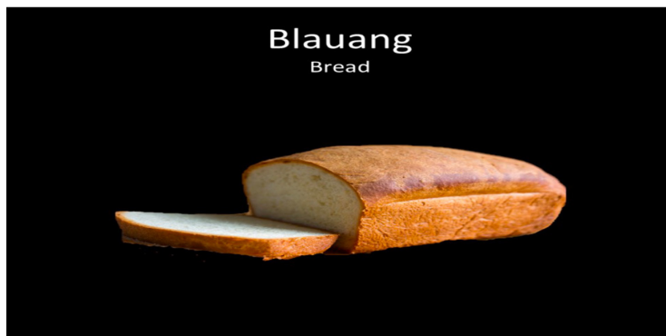
Figure 2. Example of Training Session Stimulus. All participants were trained via exposure to a picture of the Palauan noun positioned below the translation of the word in Palauan, and above the translation of the word in English. Each picture and both translations would be shown for two seconds before moving on to the next set of a picture and its respective translations.