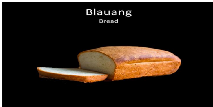
Figure 2. Example of Training Session Stimulus. All participants were trained via exposure to a picture of the Palauan noun positioned below the translation of the word in Palauan, and above the translation of the word in English. Each picture and both translations would be shown for two seconds before moving on to the next set of a picture and its respective translations.