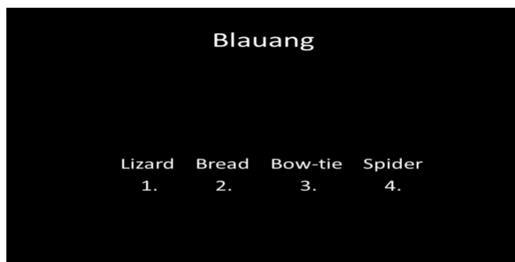
Figure 3. Example of Knowledge Check. After five words, participants were asked to perform a knowledge check in which they would be presented the Palauan translation and asked to select the English translation from four words given, using the keys 1 through 4 on the keyboard. This process repeated with five more blocks, each consisting of five new words.