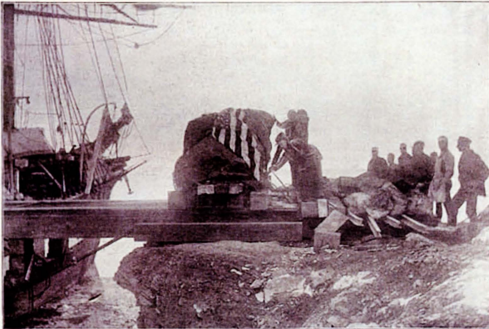
LAUNCHING THE "AHNIGHITO" ON BOARD.