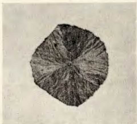
Fig. 5. Hexagonal nodule of graphite embedded in kamacite in fragment (GLF)6 ( \times 500 ). Polarized light.