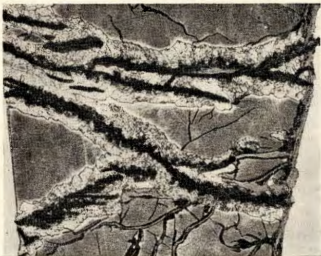
Fig. 4. Decomposed cohenite in fragment (GLF)12 ( \times c. 290 ). Etched in alkaline sodium picrate reagent. Undecomposed cohenite is stained dark. At cracks in the cohenite the compound has decomposed into black graphite and light polycrystalline ferrite. Some grey corrosion product is present at the interface between cohenite and the kamacite matrix (right side of photograph).