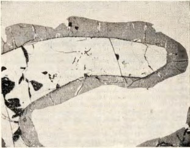
Fig. 1. Schreibersite surrounded by cohenite in [B.M. 1959, 951] ( \times c. 75). Etched in alkaline sodium picrate reagent. The schreibersite shows grey with cracks and holes (black); the cohenite has stained dark but shows unstained ferrite and black graphite along the radial cracks. The matrix is kamacite (smooth grey).