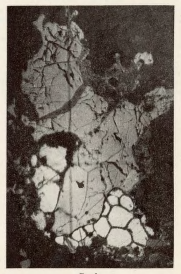
Fig. 3 The La Lande Meteorite: Kamacite, Gray; Taenite, White; and Plessite, Black, Surrounding White Taenite. Nital, 15 sec. \times 50:

Some shards of glass were noted in the oil-immersion analysis. The refractive index of this glass is 1.551. Some evidence of strain in the glass is the lack of complete extinction under crossed nicols. Because the glass could not be distinguished in thin-section, the relationship it bears to the other minerals of the meteorite could not be ascertained. According to Farrington,<sup>5</sup> meteoritic glass "abounds as inclusions and intergrowths in chrysolite [olivine], taking, in this association, a great variety of forms." This association is not, of course, universal. The occurrence of glass is taken as an indication generally of "a rapid crystallization or cooling of the meteoritic substance."<sup>6</sup>