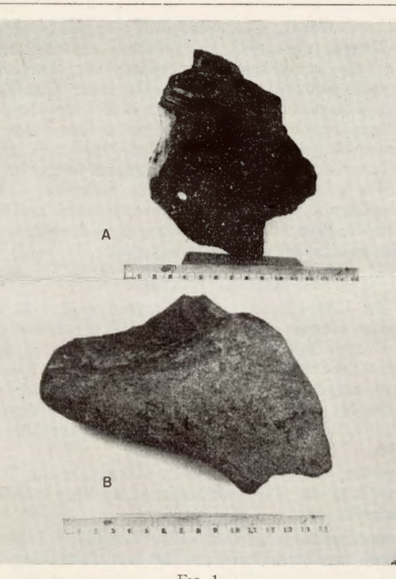
Fig. 1 The La Lande Meteorite: A. Sawed Surface Showing Dispersed Metallic Phase; B. Exterior Surface

faces exposed to weathering forces and would produce an alteration differing from that on the pre-shattering exterior surfaces.