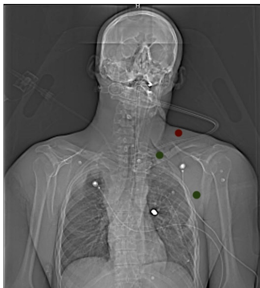
Figure 1 X-ray revealing a metallic fragment overlying the left hilum with depiction of the bullet wounds. There is one anterior wound in the left mid-supraclavicular region (red dot). Two left-sided posterior wounds are depicted with green dots with one in the superior mid-scapular region and another along the posterior midaxillary region at about the level of the third rib.

A patient in his 20s presented to our trauma bay after sustaining multiple gunshot wounds to the left thorax. Upon arrival, the patient was hypotensive with a blood pressure of 95/58 mm Hg, heart rate of 129 beats/minute, respiratory rate of 29 breaths/minute, and oxygen saturation of 94% on 10L non-rebreather. The patient was intubated for airway protection due to mentation and concern for his respiratory status. Focal assessment with sonography in trauma revealed a small anterior pericardial effusion. Initial chest X-ray showed a widened mediastinum and left hemopneumothorax with a bullet overlying the left hilum. Secondary survey and adjuncts created a puzzling picture. On the left side, the patient had three gunshot wounds in the mid-supraclavicular, superior mid-scapular, and posterior midaxillary regions ( figure 1 ). Additional injuries included a left scapula fracture, left second and third rib fractures, and fractures of the anterior T1 and T2 vertebral bodies. On the right side, the patient had a palpable thrill at the right neck and supraclavicular region and was found to have a mid-shaft clavicle fracture and a large subclavian artery pseudoaneurysm with concern for active extravasation ( figure 2 ). No injuries were identified