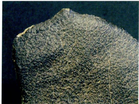
Close-up of fusion crust on end cut – actual color is rich black