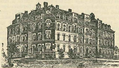
ADD-RAN UNIVERSITY--MAIN BUILDING.