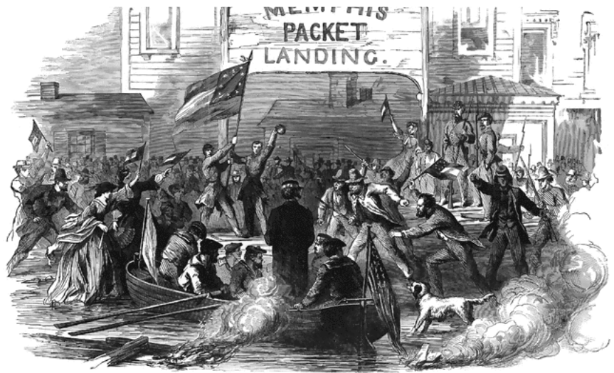
Figure 2.1. Landing of Captain Bailey and Lieutenant Perkins on the Levee, New Orleans, with a flag of truce, to demand the surrender of the city to the Federal government , engraving by Frank Leslie, 1896.

The city council convened a special session that evening, which continued into the following morning. The