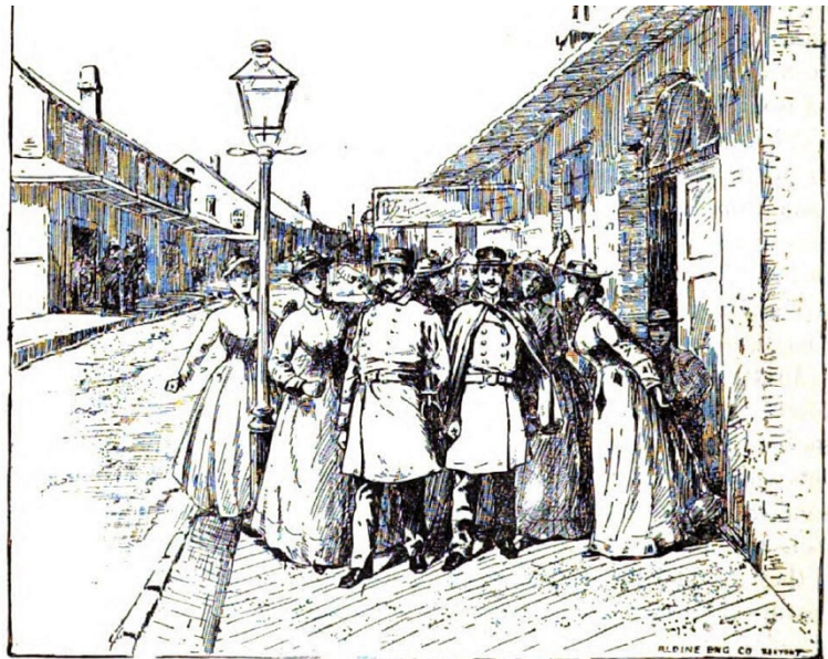
Figure 3.1. Women of New Orleans Insulting Federal Officers. Engraving by Uncredited Artist, Aldine Engraving Company, 1892. Butler's Book , 416.

catch and command the attention of citizens and soldiers alike. He knew that, if his troops attempted to arrest a woman, and the woman called for help, many strangers would come to her aid. He feared a riot caused by a woman's arrest might result if he attempted to arrest such women as had demonstrated their utmost disdain for him on the balcony. 3