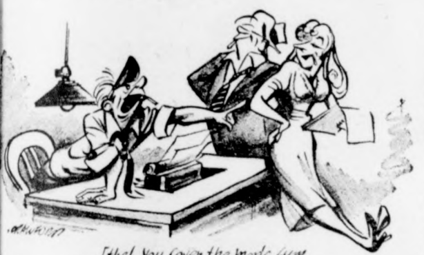
... Ethel, you cover the men's gym.

The editor—let's call him D. Fermin Bohorquez, a typical enough name—calls his staff together first thing in the morning. "All right, you guys," he says, lighting a Philip Morris, which, naturally, is the favorite cigarette of newspapermen, and of anybody else who knows a hawk from a handsaw, "All right, you guys," says D. Fermin, "this here ain't no ladies whist society, this here is a newspaper. So get out there and get the news. Get it first, get it quick, get it right! Ed, you cover the ag campus. Phil, you cover the school of mines. Wally, you cover home ec. Sam, you cover buildings and grounds. Ethel, you cover the men's gym. . . . All right, get going!"