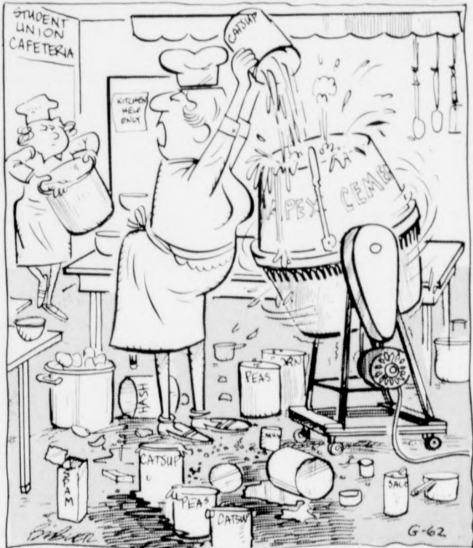
"TELL TH' MANAGER THAT WITH THE NEW EQUIPMENT I THINK WE CAN HOLD TH' PRICE ON TH' STUDENT SPECIAL."