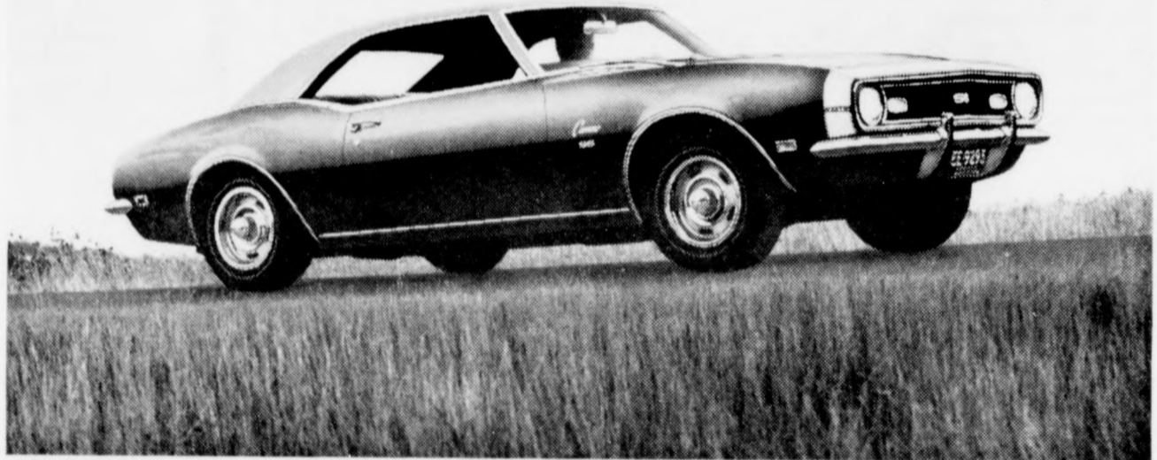
Camaro SS Coupe

'68 Camaro: Accelerates smoother, hugs the road tighter, rides quieter than ever before.