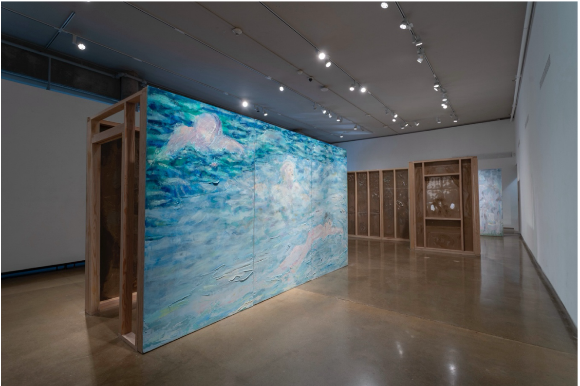
Figure 3 Installation view of Swimming, viewed from front

Upon entering the gallery space, the viewer is immediately greeted by a triptych of swimmers, whose forms are disjointed yet somehow connected. The panels, each measuring seven feet tall by four feet wide, present three swimmers in various states of movement. The first swimmer, painted in oil, is framed in a moment of calm yet rigid progression, swimming left. The second swimmer, painted in water-soluble colors, appears to be in turmoil, splashing violently, perhaps in pleasure, perhaps in distress. A cut hole where the swimmer's mouth should be adds a layer of ambiguity, suggesting both the violent rupture of the body and the breath of life or death. The third swimmer, painted in joint compound, swims out of the frame entirely, never acknowledging the other figures.