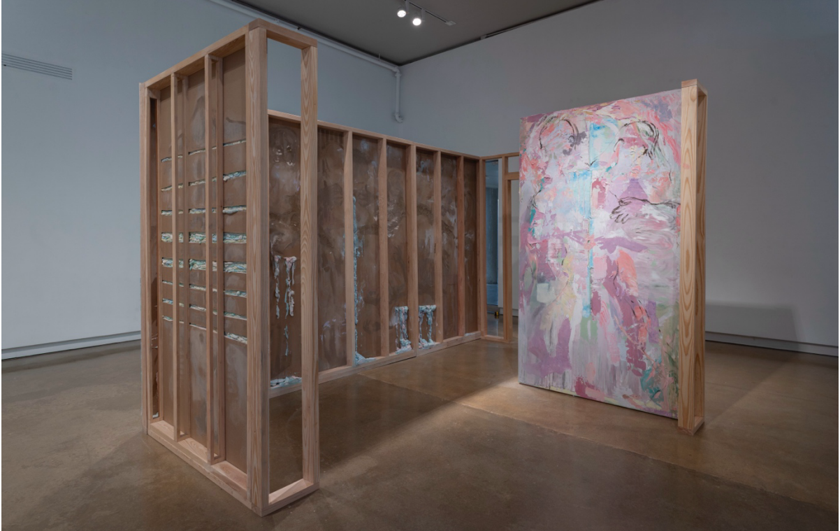
Figure 10 Installation view of Pulling , viewed from front

Butler's understanding of gender as performative becomes crucial when applied to the concept of materiality in my work. In each piece, materials like drywall and joint compound, typically associated with construction, masculinity, and labor, are repurposed to challenge these associations. By engaging with drywall in ways that subvert its conventional use—sanding it, painting it, and embedding it with figures and gestures that embody queer identities—I position these materials not as passive backdrops but as active participants in the performative creation of identity. As Butler writes, "the body is a medium through which cultural norms are enacted, re-enacted, and sometimes resisted" (Butler, 1990) 5 . In my