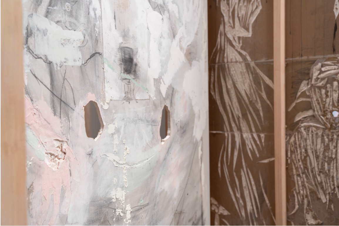
Figure 7 Detail of Screwing, viewed from front

Referencing Mark Bradford's framework in Painting After All 2 , I consider how his use of paper, a material both ordinary and layered with social meaning, creates a dialogue between personal history and broader cultural narratives. Bradford's layering, sanding, and erasure transform endpapers found across Southern California neighborhoods into a medium that disrupts and redefines the hierarchy and context of painting. Since painting through a western bias favors mediums like oil on canvas, my approach using drywall and wood recontextualizes their function within domestic and labor-driven spaces and challenges