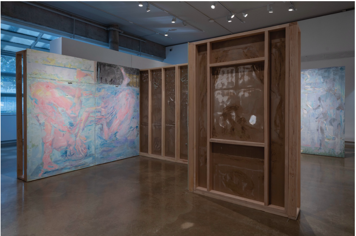
Figure 4 Installation view of Incorporating, viewed from front

by a larger figure behind it, creating a sense of layering, of bodies interwoven and coexisting. The punctured area, dripping with joint compound, serves as a reminder of the body's vulnerability and its constant interaction with the world around it. The dripping joint compound, in its slow descent, evokes the passage of time and the erosion of the self, much like the figures in the triptych.