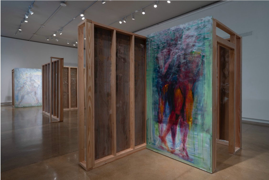
Figure 5 Installation view of Washing, viewed from front

composition. It's unclear whether a single body is being torn apart or if two are splitting—one with long hair, the other short.