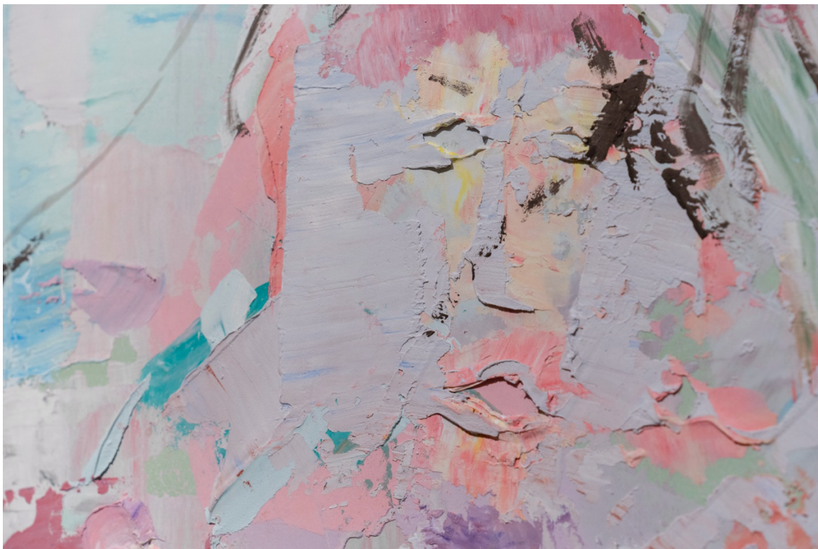
Figure 12 Detail of Pulling, viewed from front

In the end, the works in this exhibition do not offer a singular narrative but rather a series of fragmented, intimate moments that suggest the complexity and fluidity of queer identity. The materials, the figures, and the space itself all contribute to a larger conversation about the body, vulnerability, and the search for belonging. In this way, the exhibition becomes a celebration of the queerness of materials and bodies—both as they are, and as they might be reimagined.