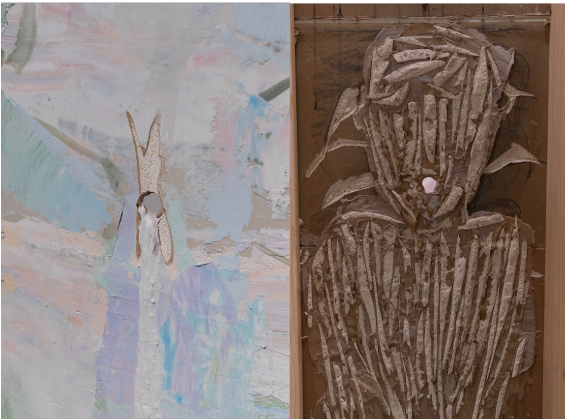
Figure 8 Detail of Spreading, viewed from front

familiar. Yet, within cultural and gendered frameworks, I am othered from it due to my queerness. The construction industry is historically coded as hyper-masculine, reinforcing rigid gender roles that exclude or diminish queerness. By repurposing drywall as a site for queer figuration, I engage a dis-identificatory act: I neither reject my personal history with these materials nor conform to their traditional cultural meanings, but instead, I manipulate them to serve a new, queer narrative.