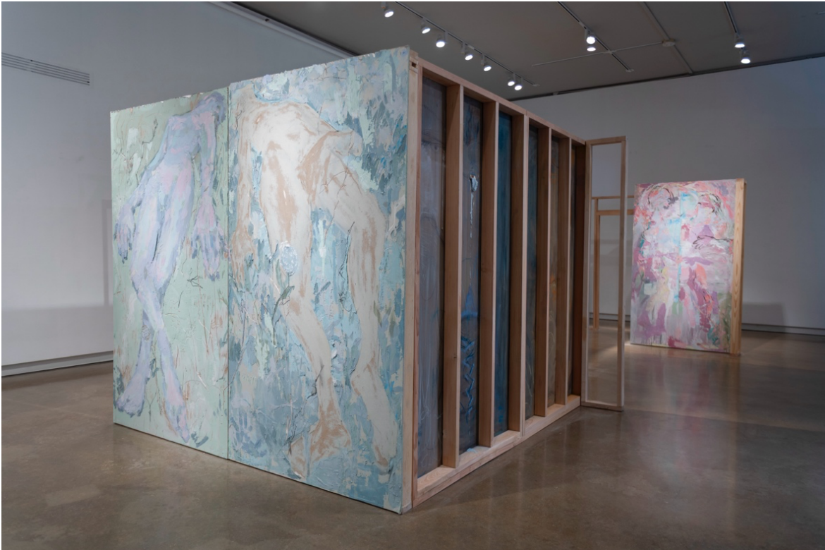
Figure 11 Installation view of Laying, viewed from front

This concept of gender as an ongoing, dynamic performance extends to the figurative works in the exhibition, where the figures themselves are in states of flux. They are neither static representations nor fixed identities, but figures in motion, between the walls, the materials, and the space they inhabit. Just as gender cannot be understood as a single, fixed category, neither can the figures in my work be understood as singular, isolated identities. They are always in the process of becoming, shaped by both the materials that construct them and the viewer who engages with them.