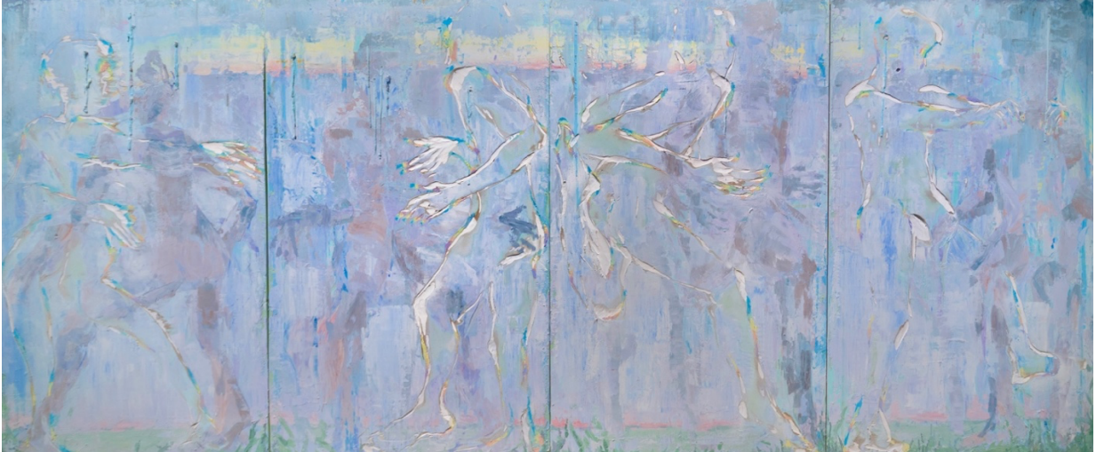
Figure 6 Playing, viewed from front

Across from this quadriptych is a diptych that further explores the theme of vulnerability. Two figures, reclining with their faces pointed away from the viewer, interlink pinkies, suggesting both connection and separation. The ambiguous space in which they lie, whether water or land, is less important than the sense of emotional and physical intimacy that it evokes. These figures, with their faces turned away, seem to embody the quiet, private moments that queer individuals often share in the face of a society that demands they conform. There is an absence of clear sexual or gendered markers here, reinforcing the idea that queer intimacy does not rely on rigid definitions but on a more fluid, experiential understanding of connection. This fluidity extends beyond the figures and into the architecture of the exhibition itself, how the viewer moves, pauses, and negotiates presence through material thresholds.