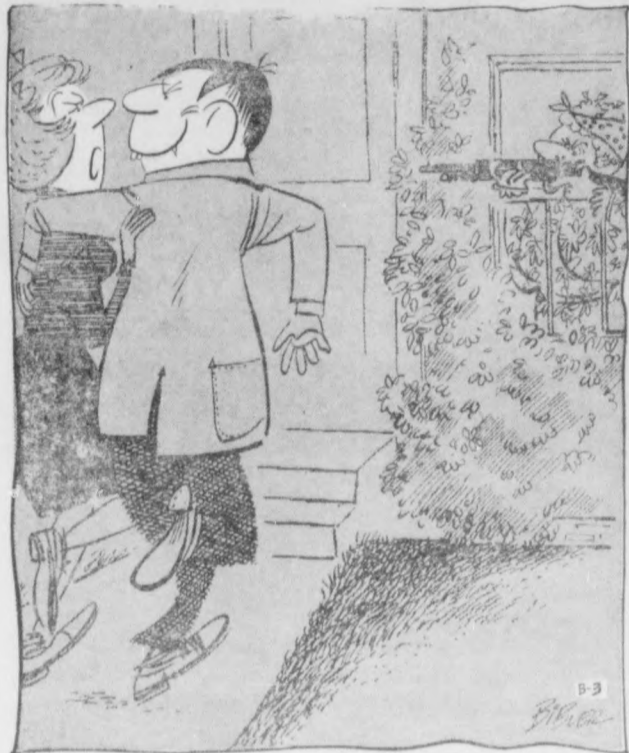
"I WOULDN'T REPEAT LAST NITE'S PERFORMANCE AT THE DOOR, WORTHAL—MY HOUSE MOTHER IS WATCHING YOU."