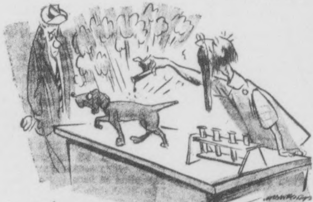
He invented the German short-haired pointer

France, as we all know, is divided into several departments.