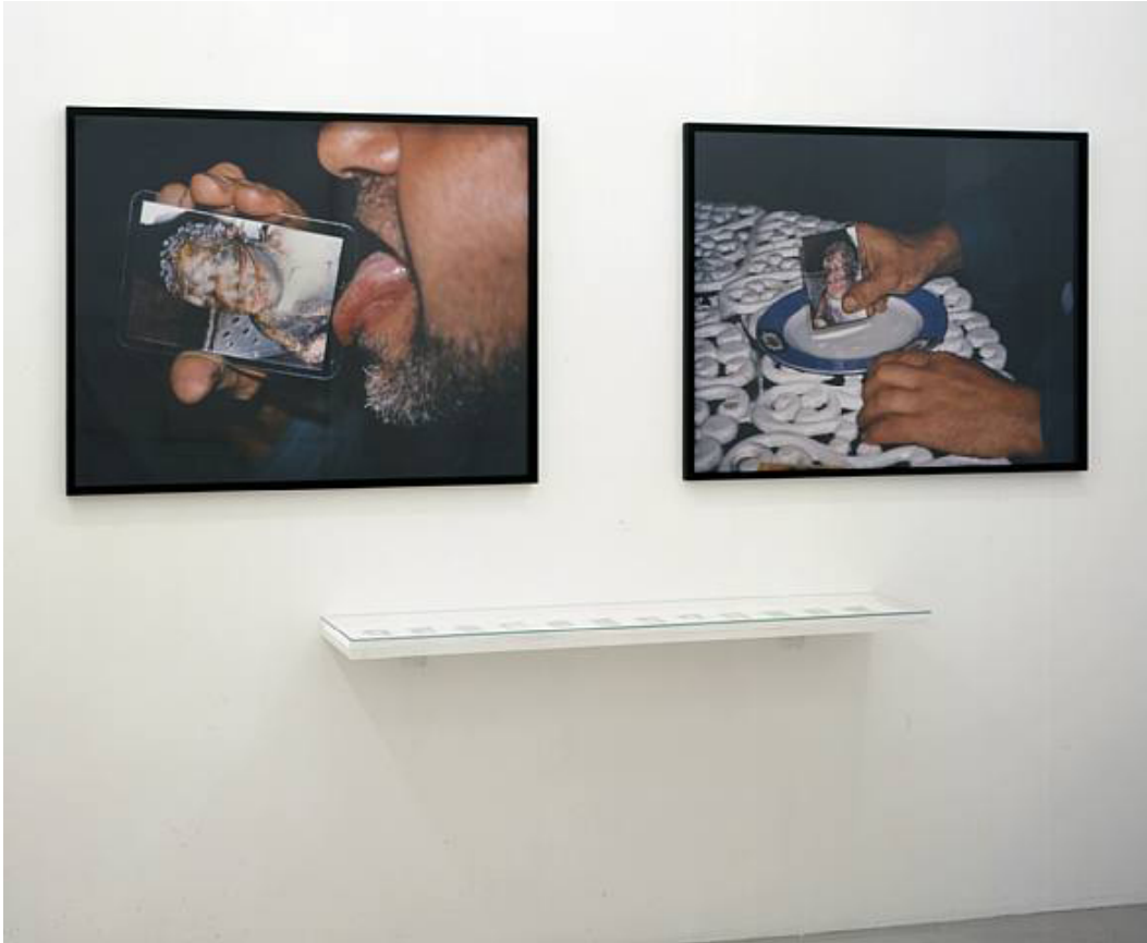
Figure 14. Teresa Margolles Cards for Cutting Cocaine, 1997-1999 2 color photographs, 12 cards 36.42 in. x 46.26 in.