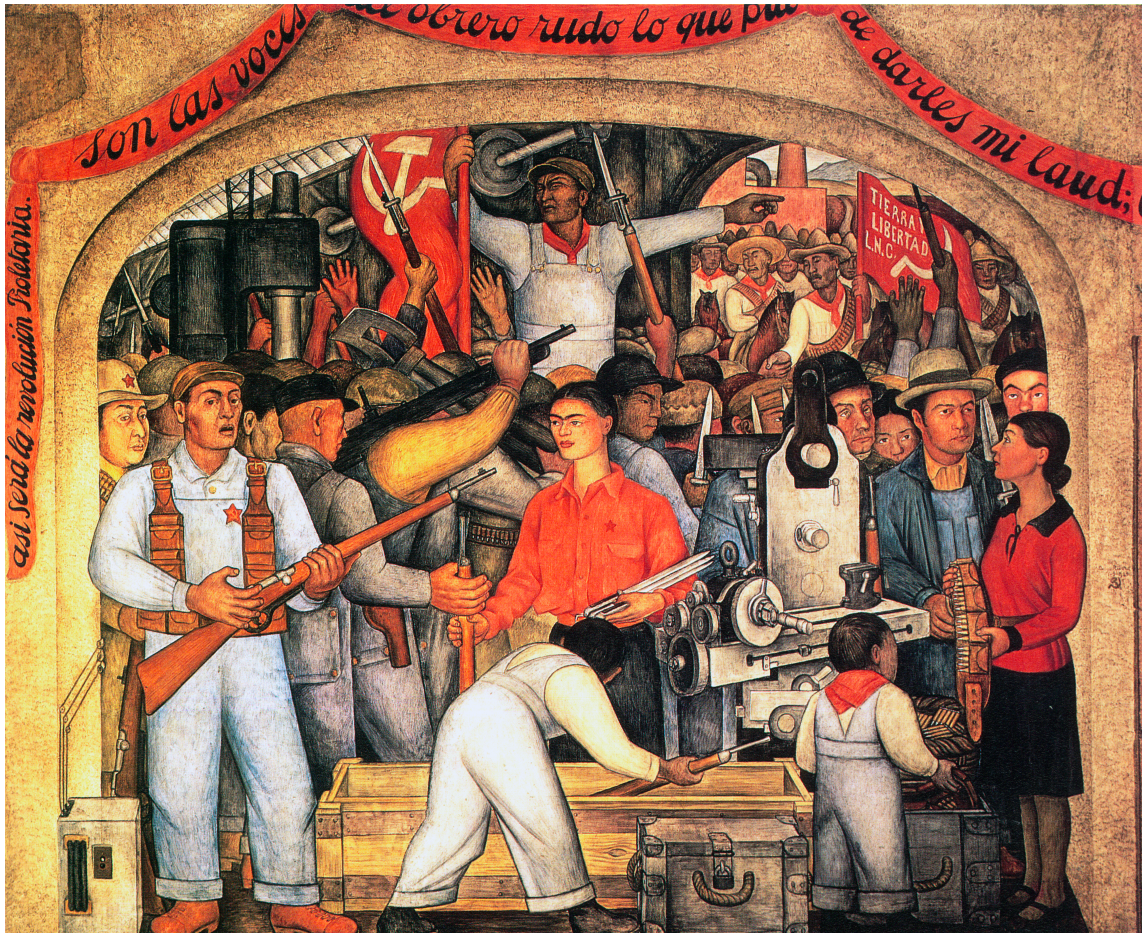
Figure 16. Diego Rivera Protest , 1928 Fresco West wall, Courtyard of the Fiestas, Ministry of Education, Mexico City Desmond Rochefort, Mexican Muralists (San Francisco: Chronicle Books, 1998), 67.