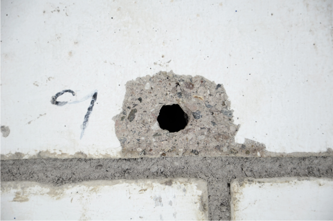
Figure 5. Teresa Margolles Detail of Muro baleado (Culiacán), 2009 Photo: Daniela Uribe “Teresa Margolles: Muro Baleado (Shot Wall), 2009,” Sala de Arte Público Siqueiros , Date accessed April 15, 2013, http://www.saps-latallera.org/saps/teresa/ .