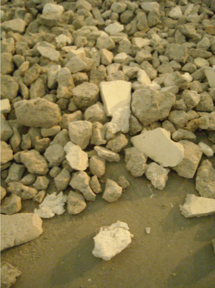
Figure 11. Teresa Margolles Detail of La Promesa, 2012 La Promesa, MUAC, Mexico City, Oct. 6, 2012 - Jan. 06, 2013