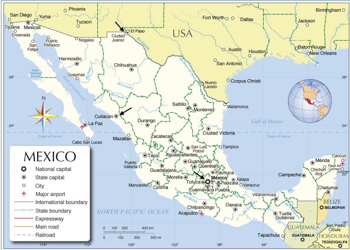
Figure 4. Map of Mexico “Administrative Map of Mexico,” One World – Nations Online , Date accessed April 15, 2013, http://www.nationsonline.org/oneworld/map/mexico-administrative-map.htm .