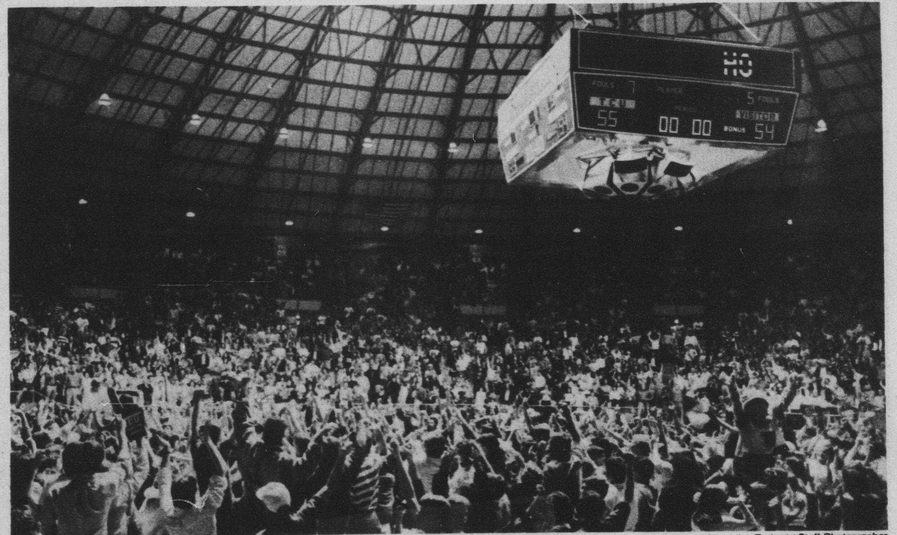
Fan-tastic - A sell-out crowd poured onto the floor of Daniel-Meyer Coliseum following the winning shot by Jamie Dixon Saturday. The win put TCU into the Southwest Conference lead. The Frogs play Texas Tech at Lubbock Wednesday night.

A press release said the institute will be located in a three-level concrete and glass structure on an 18-acre site in east Fort Worth.