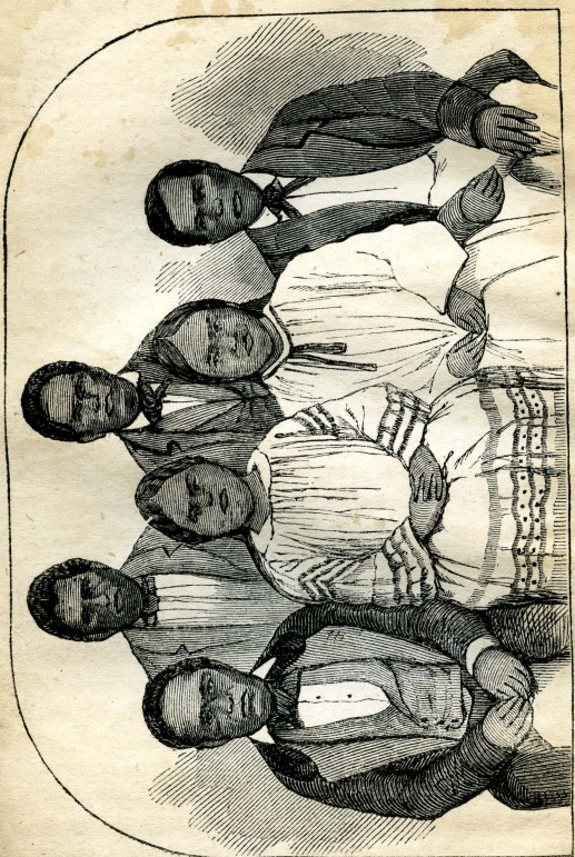
Native Teachers in Karotonga.