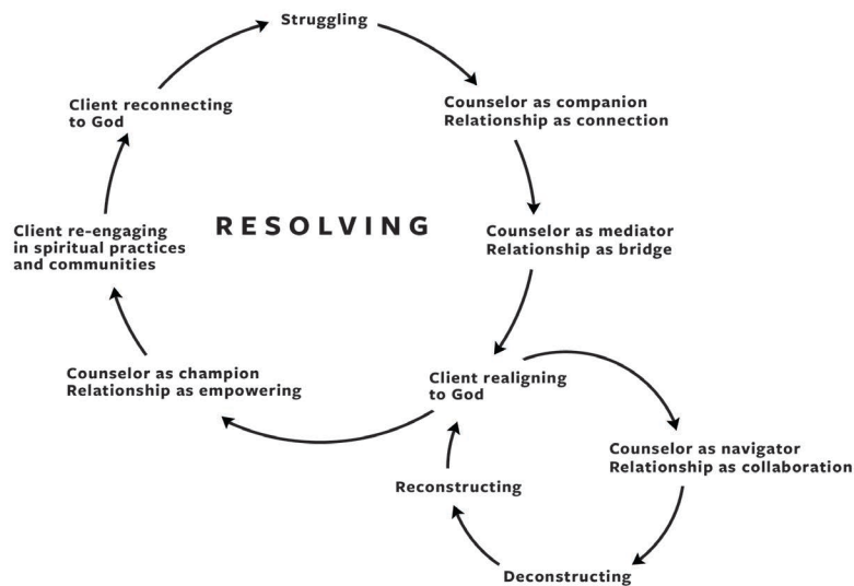
Figure 2. Common factors influence on the resolving process

Perhaps this study's most significant contributions to the literature occurs at the intersection of the religious coping and common factors research. This study focused on how a counselor's way of being and the therapeutic relationship influenced growth pathways. Given that these two common factors are the greatest therapeutic predictors of client change (Fife et al., 2014), how they specifically interact with the resolving process is of ultimate concern to therapists working in the area of r/s struggles. To illustrate visually these key findings, I have provided the following diagram.