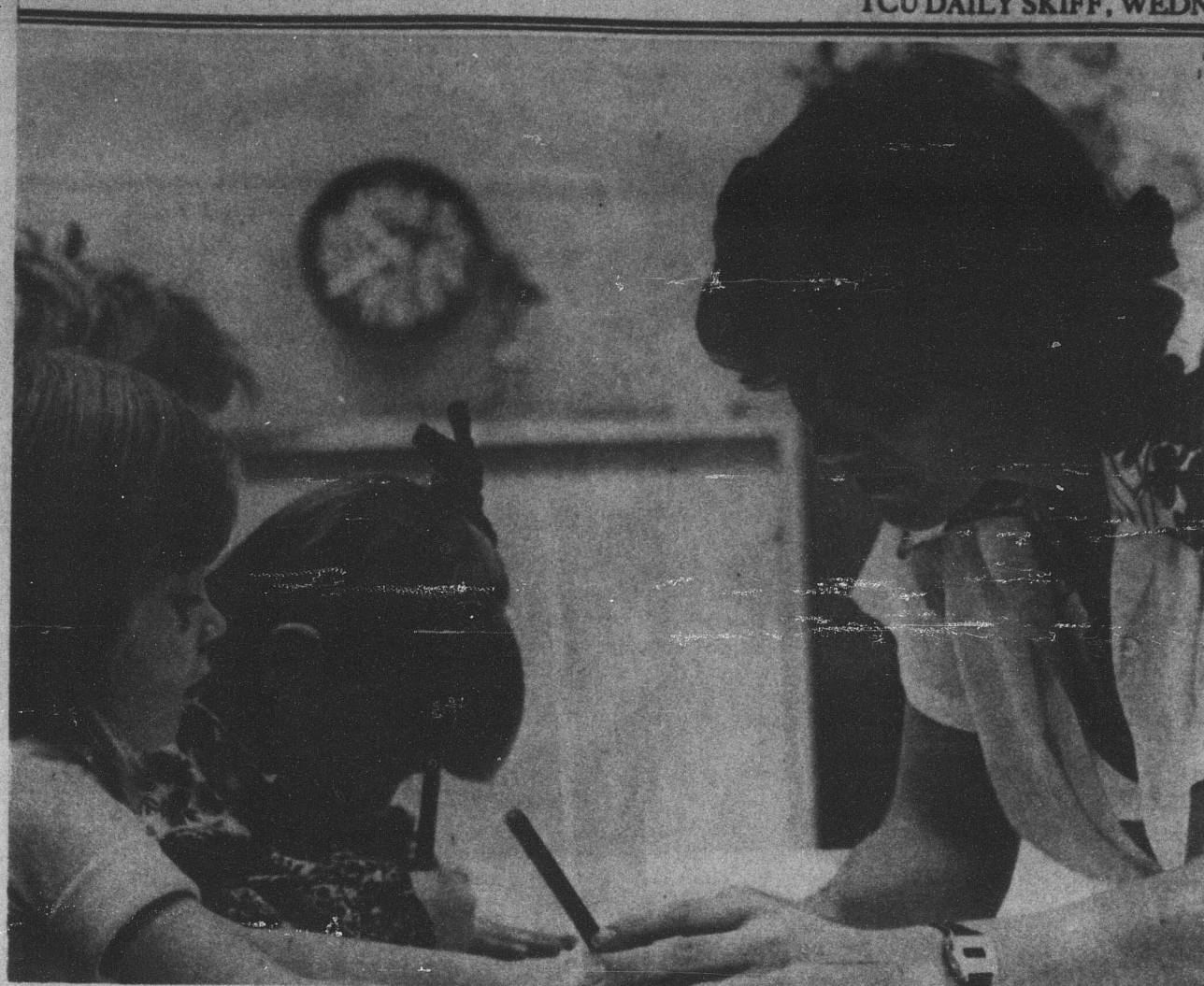
GIVING GUIDANCE—TCU students work with area children at the Miller Speech and Hearing Clinic, located on the northwest side of campus.

Extra cards may be obtained by calling the Personnel Office.