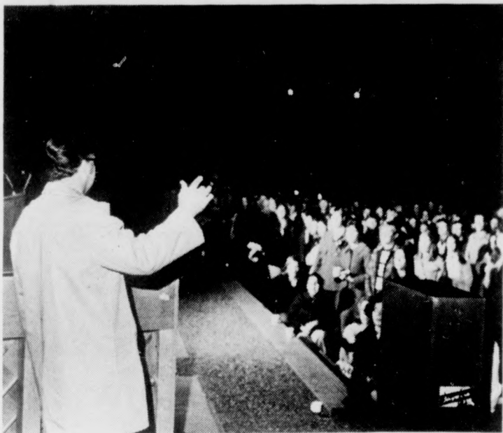
YULETIDE LOOK Scene of the Ceremony of Lights and Carols