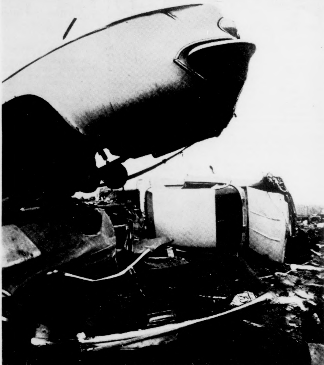
Let's hear it for the drunks.