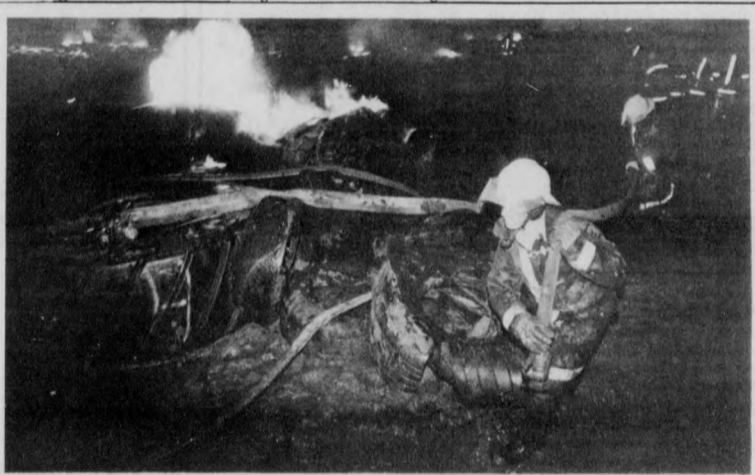
BURNING RUBBER: A Burleson fireman rushes to the middle of burning tires Tuesday near the 800 block of North Burleson Boulevard.

The new budget carries forward major strategic programs, which Weinberger said will result in "a proper balance" with the Soviet Union in long-range nuclear weaponry by 1989, if allowed to reach their planned potential.