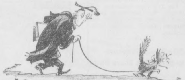
"I walk Prexy's cat twice a day!"