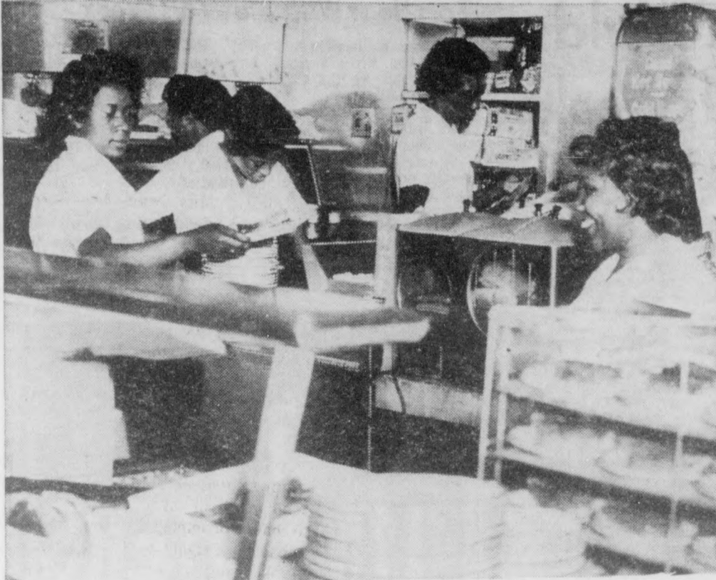
Help in the Snack Bar cleans up before the breakfast rush. During the morning hours, 288 honeybuns, a type of breakfast roll, are