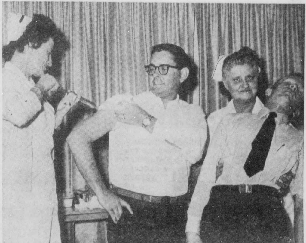
Stick 'Em Up

Not included are student salaries and fellowship costs. White pointed out that for some purposes, the figures are meaningless as professional and non-professional salaries are "merged." However, the report is an indication of the TCU payroll for the fiscal year.